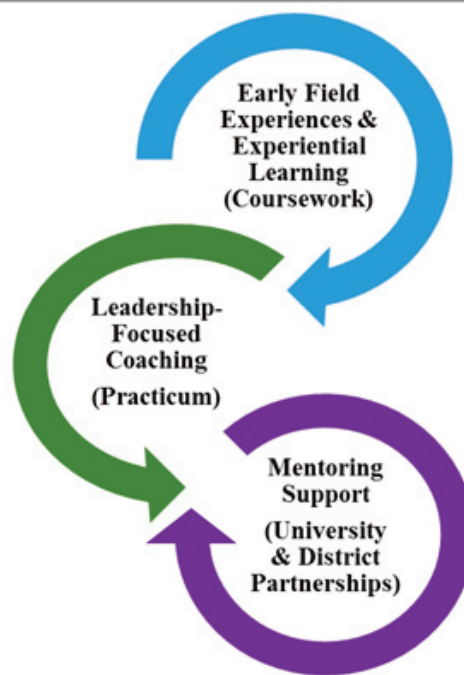
Figure 1: Conceptual diagram of model

The final part of the conceptual model involves mentoring support within the school district. Once in leadership positions, districts would select principal or district-level mentors for new instructional leaders. University instructors would support this by developing and providing ongoing mentoring workshops, professional development, and resources for such mentors.