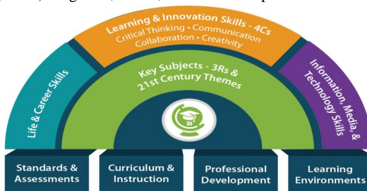
Figure 1. Framework for 21 st Century Learning (P21 Framework, 2019a)

The term '21 st century skills' refer to the 3 core competencies namely; reading, writing and arithmetic, as well as many other essential skills, such as digital literacy, critical thinking, communication, collaboration, global competencies, and problem-solving skills (Yıldız & Parlak, 2016). Figure 1, below, shows the components of the 21 st century skills.