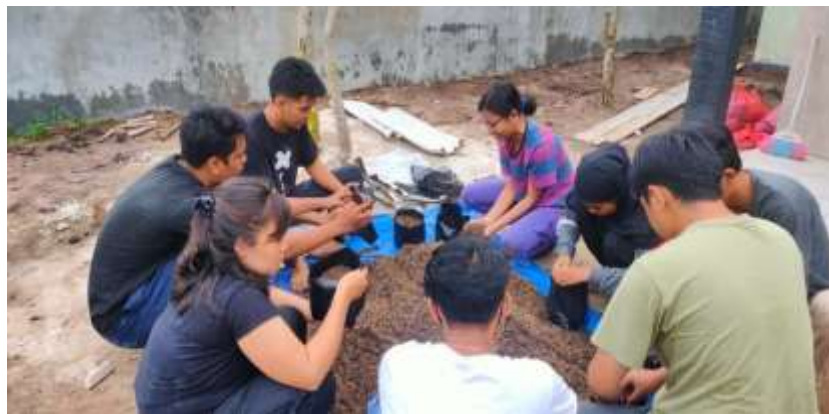
Fig. 1. The process of seeding and preparation for planting chili

The seeding activity will be carried out on August 14, 2021 to September 3, 2021 so that it is ready to be transplanted into polybags so that growth is more optimal and produces good fruit, Fig. 1. The usefulness of this food security work program is aimed at the people of Mawar Mekar Village. As the KKN-T participants we took the example of planting cayenne pepper in order to help one of the basic needs of the community, because chili plants can be planted in the yard area of the house so that it is easy to care for the people of Mawar Mekar Village.