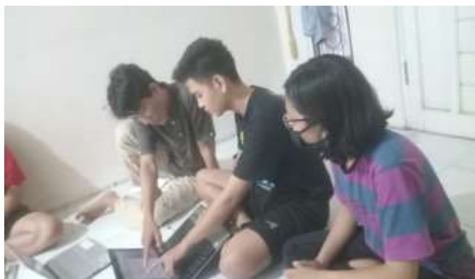
Fig. 4. Profiling Mawar Mekar Village

be the place for the implementation of the Food Estate, and Mawar Mekar village was one of the selected areas, namely the location of additional land for growing rice. The word "Mawar" is taken from one of the names of handlers in Mawar Mekar Village, namely Handel Mawar. The Handel Mawar empties into the Kapuas Murung River. While the word "Mekar" has the meaning of developing, independent and beautiful according to the expectations of the people of Mawar Mekar Village. The government organizations in Mawar Mekar Village include the Village Head and Village Apparatus (6 people), BPD (9 people), RT Chair (9 people) and Handel Head (3 people). The potential of Mawar Mekar Village is Rice Fields, Crystal Guava, Rambutan, Galam and others. The profiling of Mawar Mekar village was carried out on August 11, 2021 to August 29, 2021, which took place at the post for the Period II KKN-T Group in 2021, Mawar Mekar Village on Jl. G. Obos XIX A, Palangka Raya.