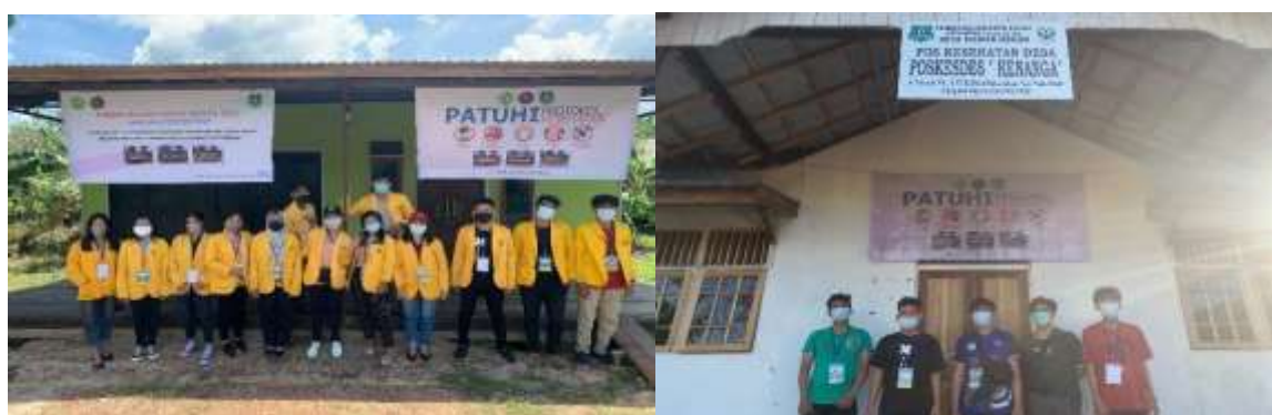
Fig. 3. Installation of Health Protocol Socialization Banners