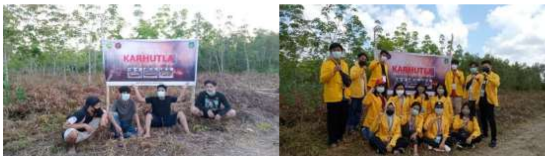
Fig. 2. Installation of KARHUTLA banners in Mawar Mekar Village