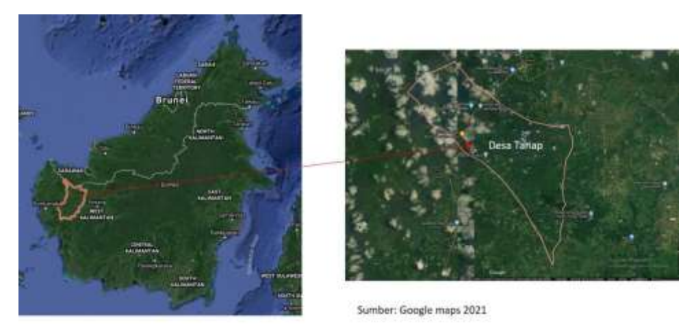
Figure 1. The Tanap village of Sanggau Regency

The subject of this research is Dayak Muara ethnic community in Tanap village Sanggau regency.