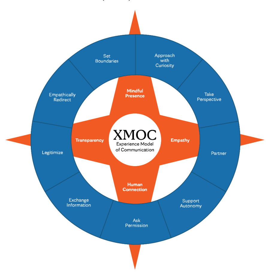
Figure 6. Experience Model of Communication (XMOC)