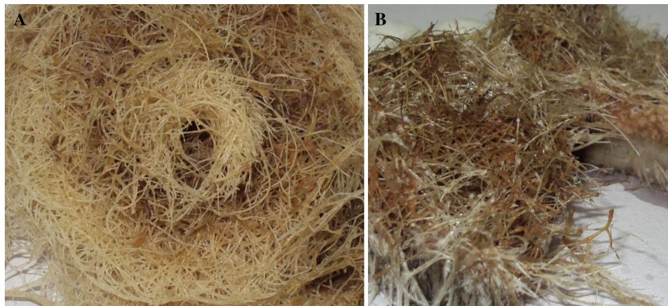
Fig. 3 Hairy root morphology in different bioreactors: a liquid-phase bioreactor, b combination of gas- and liquid-phase bioreactor (modified NMB)

accumulation obtained using batch cultivation in nutrient mist bioreactor and other bioreactor configurations. Figure 3 shows the images of plant roots grown under liquid-phase and modified nutrient mist bioreactors. In the modified nutrient mist bioreactor, the root tips were found to be fast growing, highly branched, plagiotropic and hairy in appearance. The hairy appearance of roots in the mist mode of bioreactor operation helps them to capture and retain the mist more efficiently and also provides more surface area for gaseous exchange. In contrast, the roots grown in a liquid-phase reactor are less hairy, slow growing and comparatively less branched. Such a modified nutrient mist bioreactor is, therefore, much better than the conventional mist bioreactor and not only has ultimate commercial application for artemisinin production using hairy root cultivation but also can be useful as a model nutrient mist bioreactor configuration for other systems.