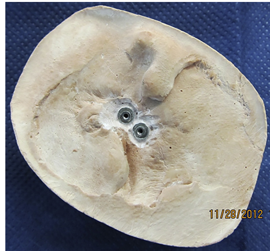
Fig. 1. Cast model with external hexagon system of extraoral implants analogues.

There are four ways to retain a prosthesis: anatomically, mechanically, surgically, or by adhesion. 12 In the present study the anatomical, mechanical, chemical, and surgical