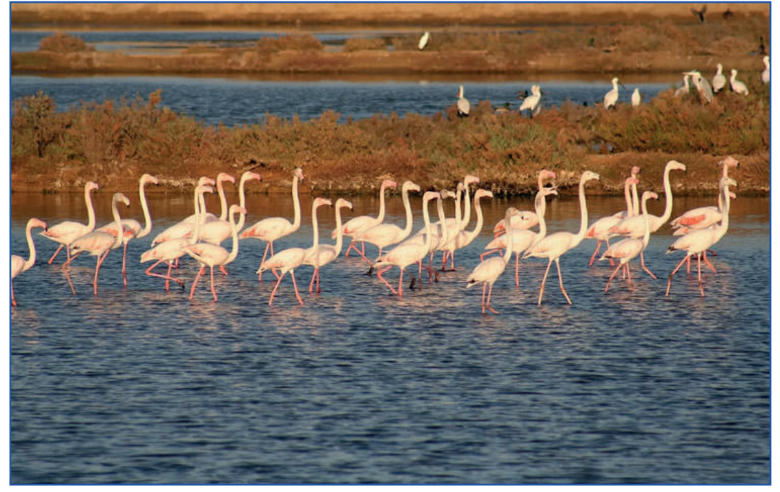
Figure 2:Example of Wildlife in Ria Formosa

Several studies and projects on hydrodynamic, microbiological, climatic, economic and social issues in this territory are already available or ongoing. It seemed important to us to complement some of the