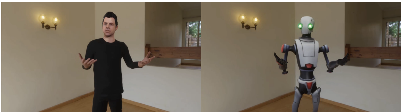
Figure 1: We explore the impact of voice, motion, and appearance realism configuration on an agent’s perceived likability, human-likeness, and speech-gesture match. Shown are two sample frames of the Human and the Robot character in our Full Natural motion condition.

Rachel McDonnell ramcdonn@tcd.ie Trinity College Dublin Dublin, Ireland