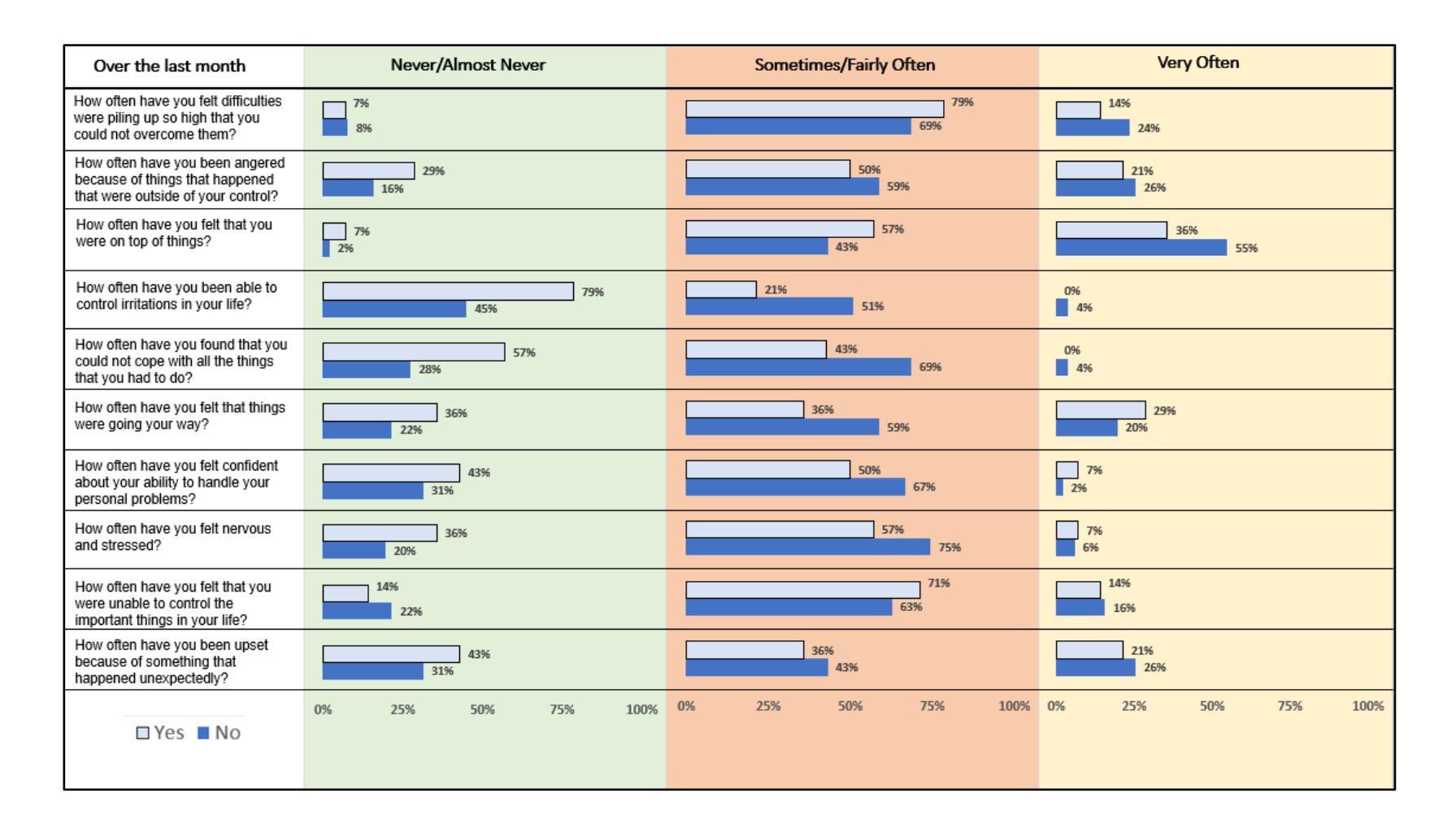
Figure 2. Item-wise analysis of perceived stress reported by college students engaged or not engaged in introspective meditation. Figure legend: Yes, corresponds to students engaged in the introspective meditation; No, corresponds to the students who were not engaged in the introspective meditation.