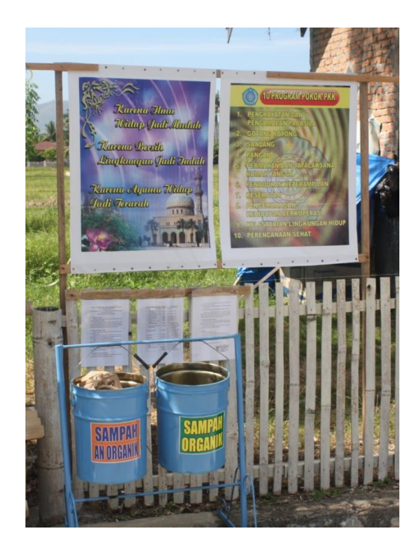
Figure 19. They separate between organic and un-organic rubbish