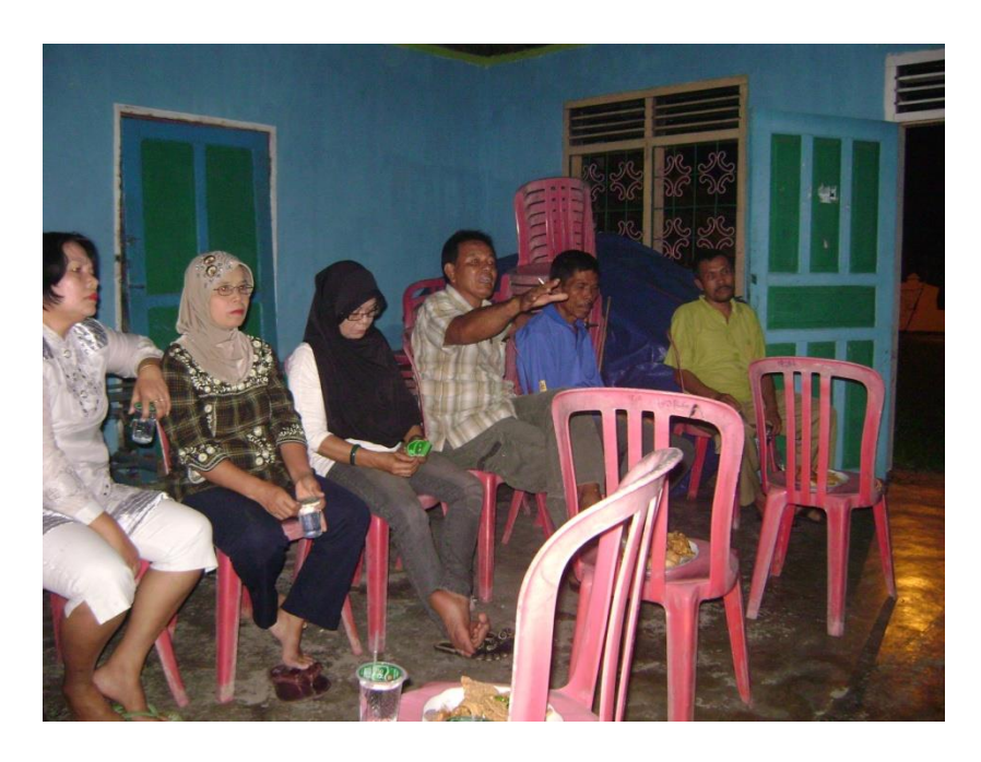
Figure 3. The citizen are curious to discuss about finding out the solution of their problems