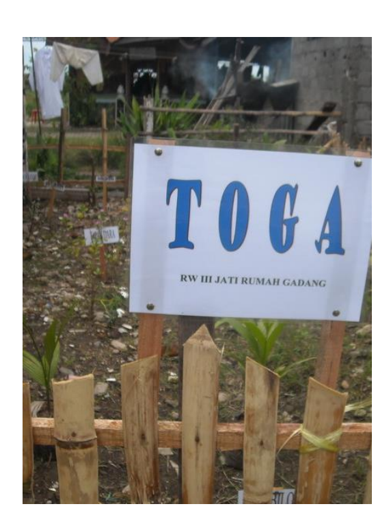
Figure 10. Growing the family-herbal plants

Toga stands for family herbal plants. This is the examples of herbal plants which they plant in their house yard.