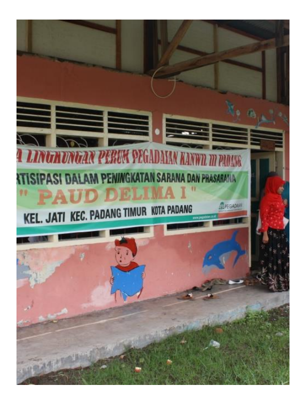
Figure 21. Earlier Child Education and Development