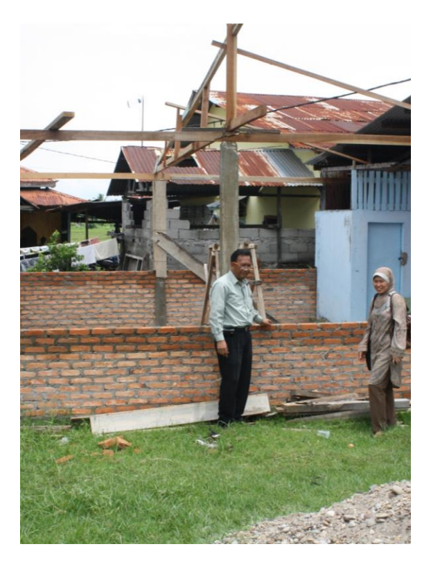
Figure 24. Building Based On Community Funding