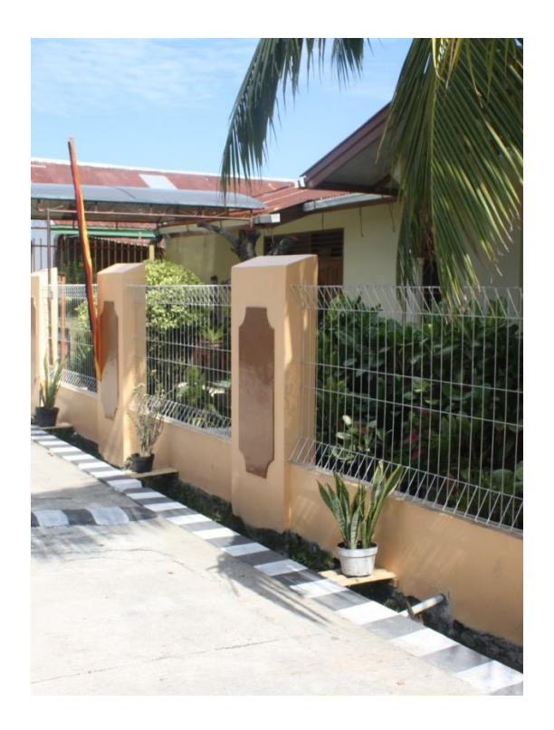
Figure 20. The environment is clean, no garbage in ditch