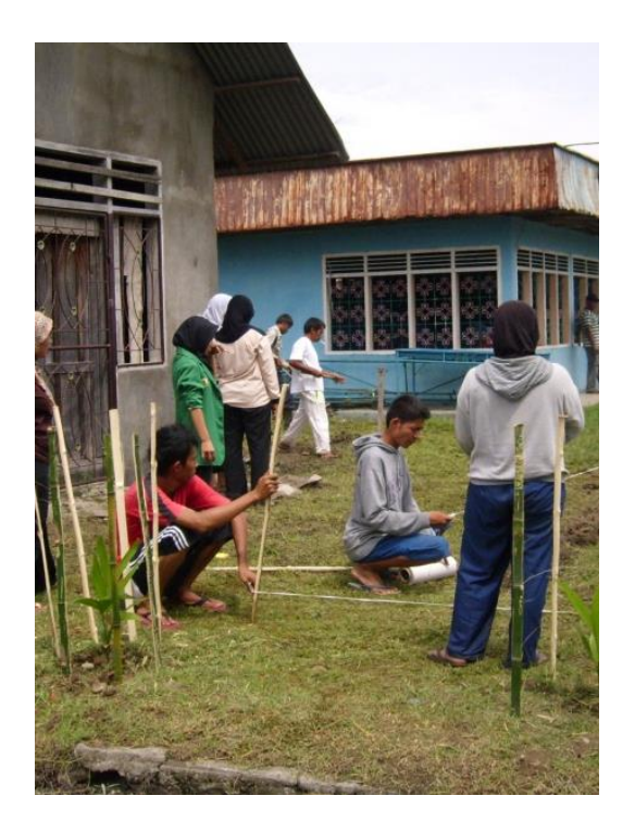
Figure 9. Making the bamboo fence of the family herbal plants