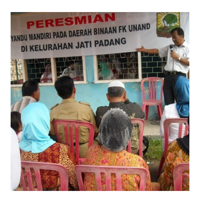
Figure 15. Relocating integrated service for health "buah Delima 1" to youth centre