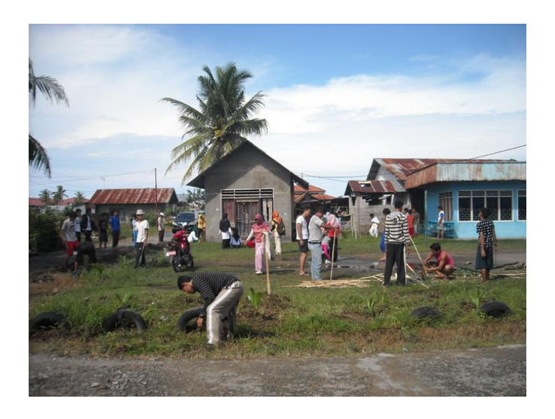
Figure 8. Application of cooperation with citizen and college student