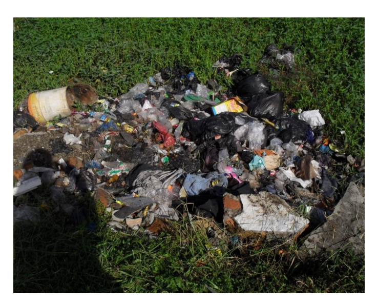
Figure 1. Attitude of the community throw away all garbage in environment

The first step is mapping the health problem of Jati village. This data could provide as a base line data and as magnitude of the problem as well. We identified potential problem of the Jati village by interviewed 200 respondents and made some observation of the environment.