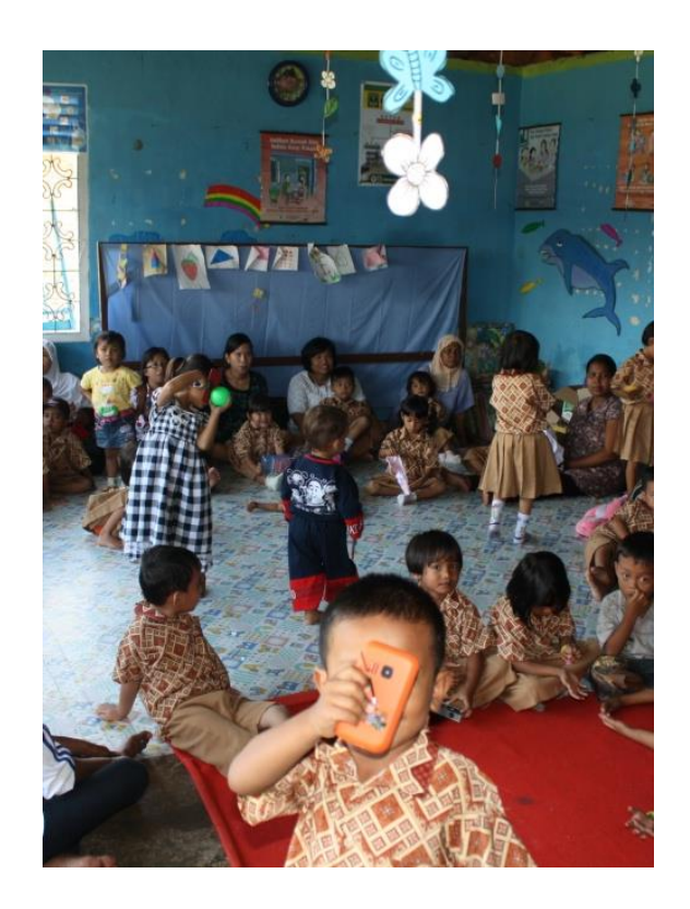
Figure 22. The Children Aged 2-5 Years Are In School 3 Times In A Week