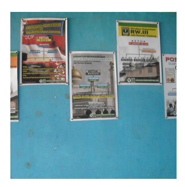
Figure 12. Setting & sticking the structure of organization