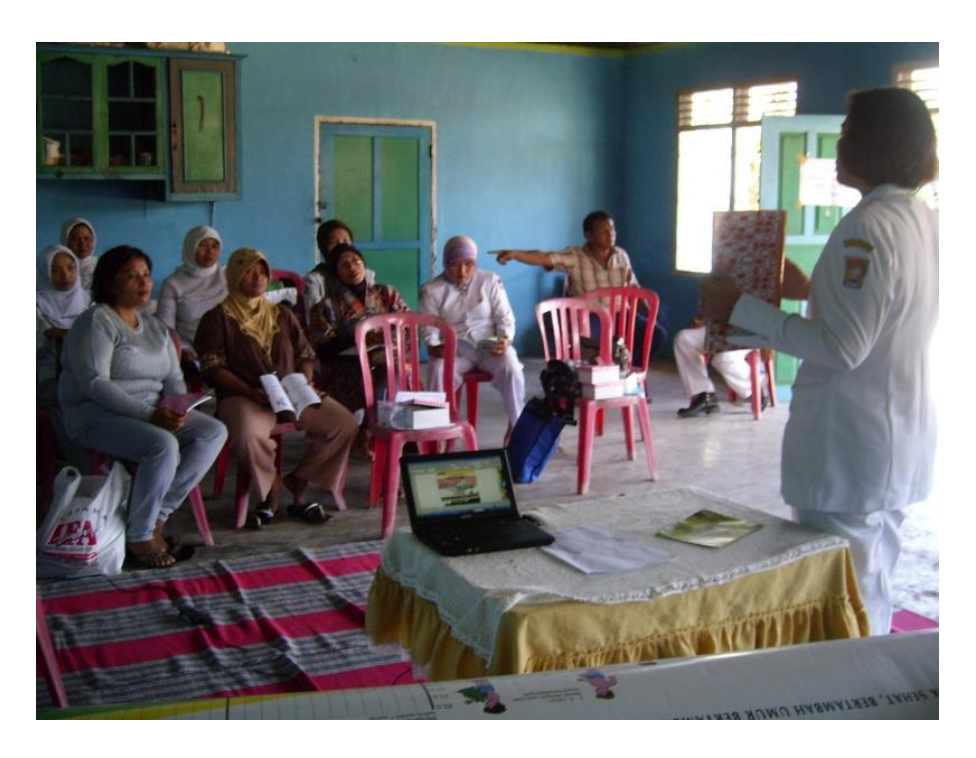
Figure 13. Refreshing the cadre of integrated public health services