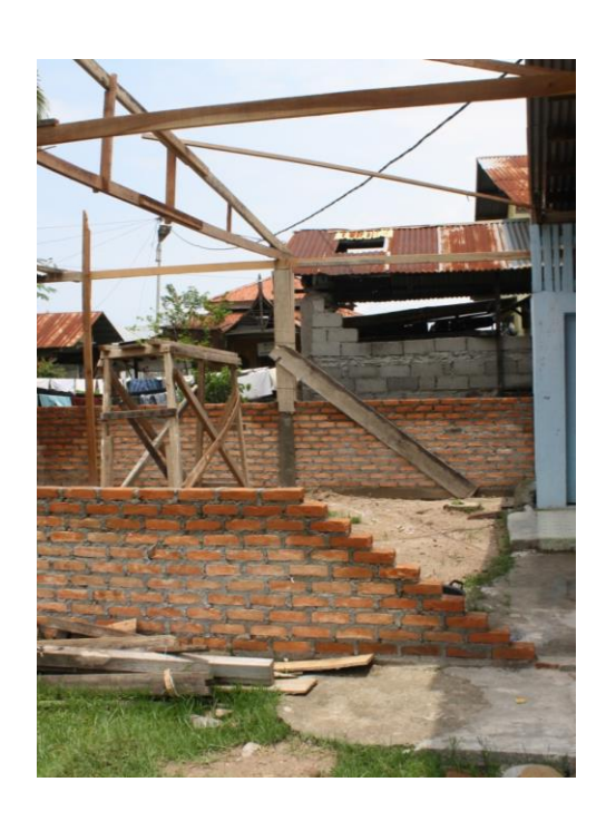
Figure 23. Additional Room For The Actifity For Senior Citizen 2011