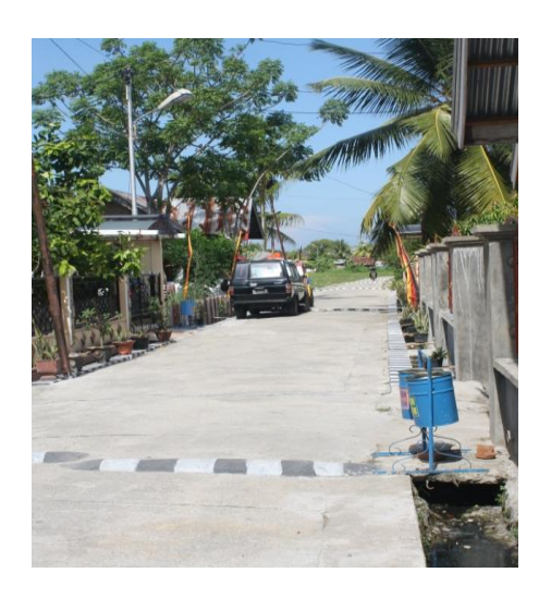
Figure 18. This environment after being renovated