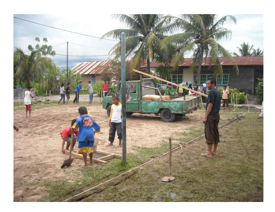
Figure 11. Guiding the young generation through restoring the sport youth centre "volley court"