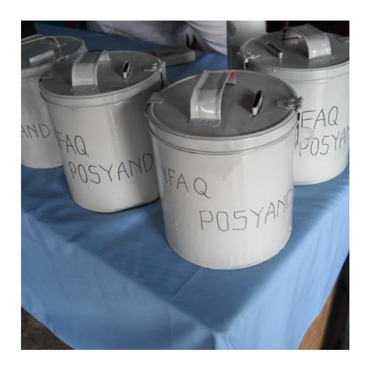
Figure 14. Making Active "the distributing thousand for health" each house hold