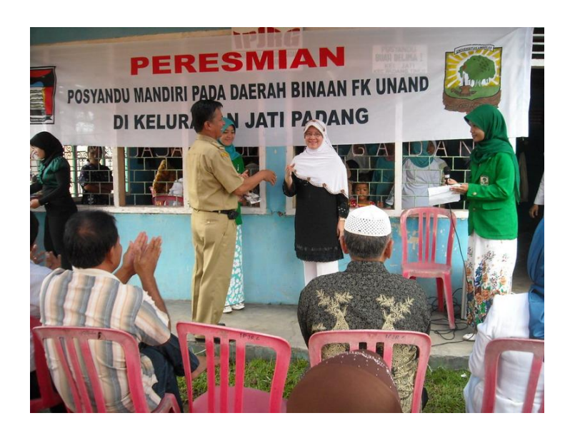
Figure 16. Official ceremony of the new revitalization of integrated public health