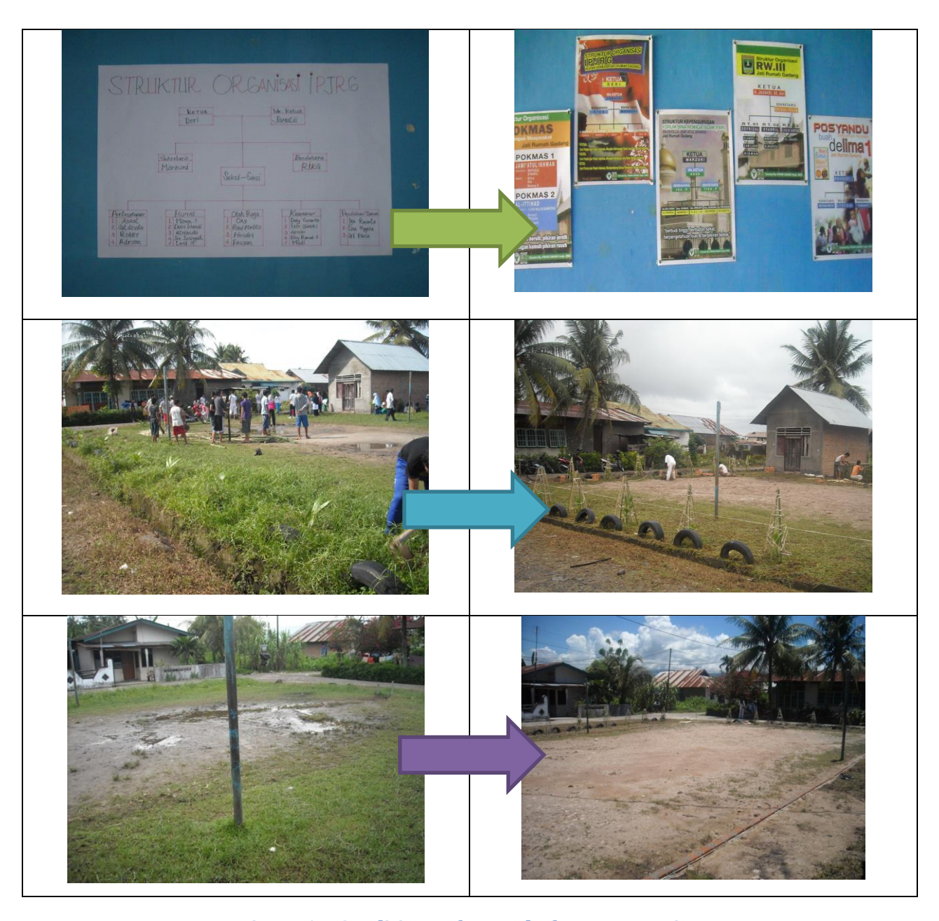
Figure 17. Condition Before and After Intervention