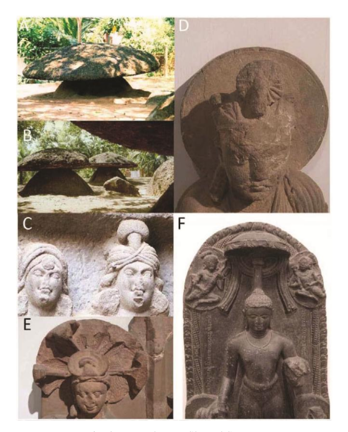
Fig. 3 — Mushroom Shaped Statues

Buddhist, Tantric and Taoist traditions and literature<sup>9</sup> refer to "magic mushrooms" and "divine mushrooms". Reviews<sup>36</sup> of biographical accounts of some legendary adepts from the first millennium (200-900 CE) provide indications of entheogenic practices represented in symbols that suggest that they consumed A. muscaria as a tool for achieving enlightenment. Analysis of materials from The Stories