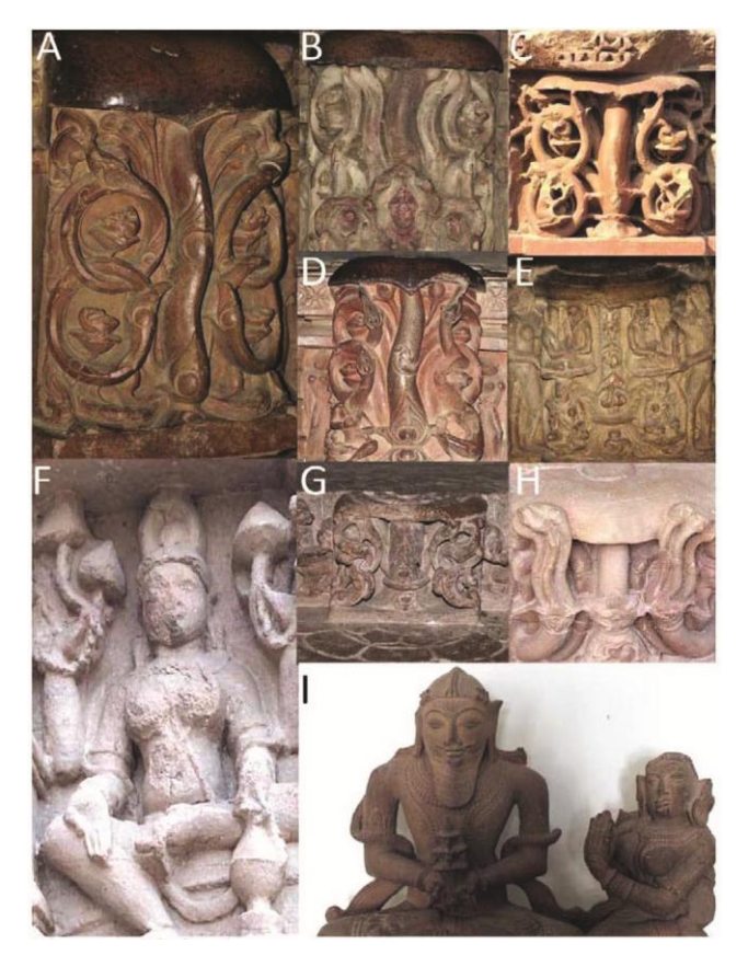
Fig. 4 — Khajuraho

a- Chitragupta Threshold 975 CE; b- Jagdambi Threshold 975 CE; c- Parvati Threshold 959 CE; d- Vishvanath Threshold 1002 CE; e- Parshwanath Thresold 953 CE; f- Lakshman Complex Statue 950 CE; g- Jain Museum; h- Lakshman Temple Northeast Sanctuary Thershold 950 CE; i- Chandella King and Queen with Triple Parasol 1003-1035 CE.