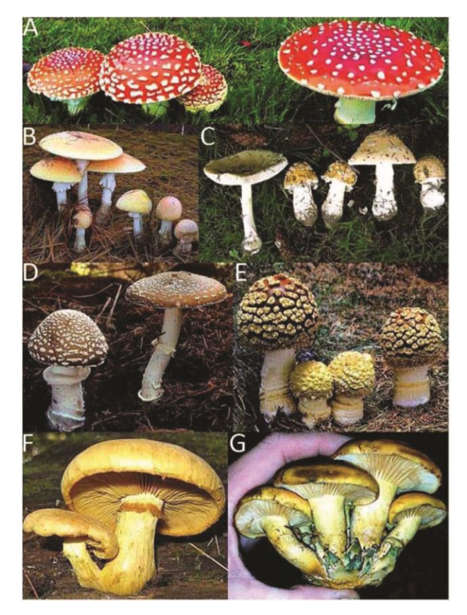
Fig. 1 — Amanita and Gymnopilus Species: a- Amanita muscaria, b- Amanita muscaria var formosa; c-Amanita gemmate; d-Amanita pantherina, e-Amanita regalis, f-Gymnopilus luteus, g-Gymnopilus spectabilis.

The Supplementary Table 1 "Psychoactive Mushroom Species Reported from India" presents the findings of psychoactive mushroom species that have been documented for India with the locations. repository information and psychoactive ingredients; some of these species are illustrated in Fig. 1 and Fig. 2. The 36 psychoactive species of India presented were first derived from the list of Guzmán, Allen and Gartz<sup>31</sup> and augmented through review of approximately 80 published papers and 50 online articles on the genera Amanita, Copelandia, Gymnopilus, Inocybe, Panaeolus and Psilocybe in India. These species were assessed with reference to