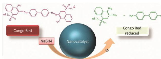
Fig. 1 — Catalytic reduction mechanism of Congo red dye

This could be explained by Langmuir-Hinshelwood adsorption model as shown in (Fig. 2). According to this model all the reactants, aromatic nitro compound and reducing agent NaBH 4 gets adsorbed on nanoparticle surface. NaBH 4 dissociates into ions Na + and BH 4 - where BH 4 - acts as an electron donating