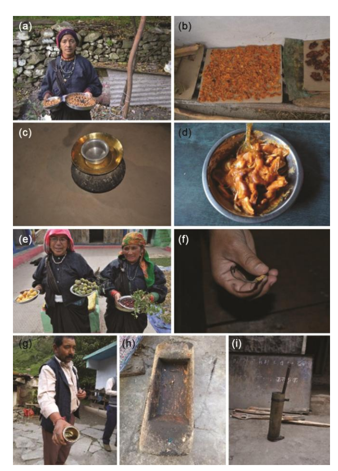
Fig. 4 — Photographs representing indigenous utilization of wild fruits: a - A Bhotia women collecting stones of wild apricot, b - Sun drying of wild apricot and Kirol, c - Utensils used for distillation to prepare local liquor, d - Chutney prepared from Apricot fruits, e - Tribal women collecting wild fruits of Prunus , f - Keeda jari- Cordyceps sinensis. , g - Bhotia man showing oil of wild apricot, h - Wooden mechanical oil extractor, i - Dungboo prepared from wood of Dendrocalamus strictus used for preparing local tea from Taxus baccata (Thuner ki chai)

NW Himalayas between an altitude of 700 m to 2700 m asl, available in and around habitation in semi domesticated form<sup>11</sup>; Rubus ellipticus-a potential fruit facing heavy exploitation pressure was found growing in wild and semi-wild forms. One of the most important potential wild edible fruits Hippophae rhamnoides, a thorny shrub reported to be distributed in high altitudinal zones of Jammu & Kashmir, Himachal Pradesh, Uttarakhand in NW Himalaya and North Sikkim in Eastern Himalaya<sup>29</sup> along with Hippophae salicifolia, a thorn less shrub/small tree; a potential wild edible nut Corylus jacquemontii found to be distributed from 2500 m to 3500 min Uttarakhand is also available in the valley. Malus baccata, a potential wild relative of domesticated apple, rarein occurrence and reported to be distributed