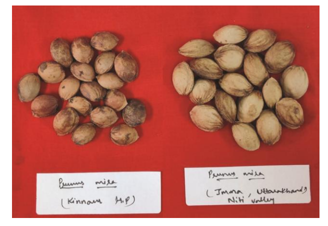
Fig. 6 — Photograph representing Stones of P. mira collected from Niti valley, Uttarakhand (mentioned as Prunus persica in Flora) and Kinnaur (Himachal Pradesh).

in temperate regions of NW Himalaya<sup>5,11</sup> was not seenin Niti valley.