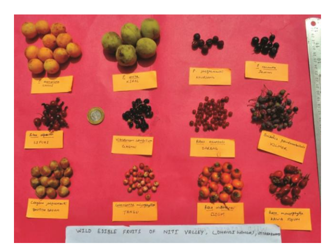
Fig. 5 — Wild edible fruits collected from Niti valley.

NW Himalayas between an altitude of 700 m to 2700 m asl, available in and around habitation in semi domesticated form<sup>11</sup>; Rubus ellipticus-a potential fruit facing heavy exploitation pressure was found growing in wild and semi-wild forms. One of the most important potential wild edible fruits Hippophae rhamnoides, a thorny shrub reported to be distributed in high altitudinal zones of Jammu & Kashmir, Himachal Pradesh, Uttarakhand in NW Himalaya and North Sikkim in Eastern Himalaya<sup>29</sup> along with Hippophae salicifolia, a thorn less shrub/small tree; a potential wild edible nut Corylus jacquemontii found to be distributed from 2500 m to 3500 min Uttarakhand is also available in the valley. Malus baccata, a potential wild relative of domesticated apple, rarein occurrence and reported to be distributed