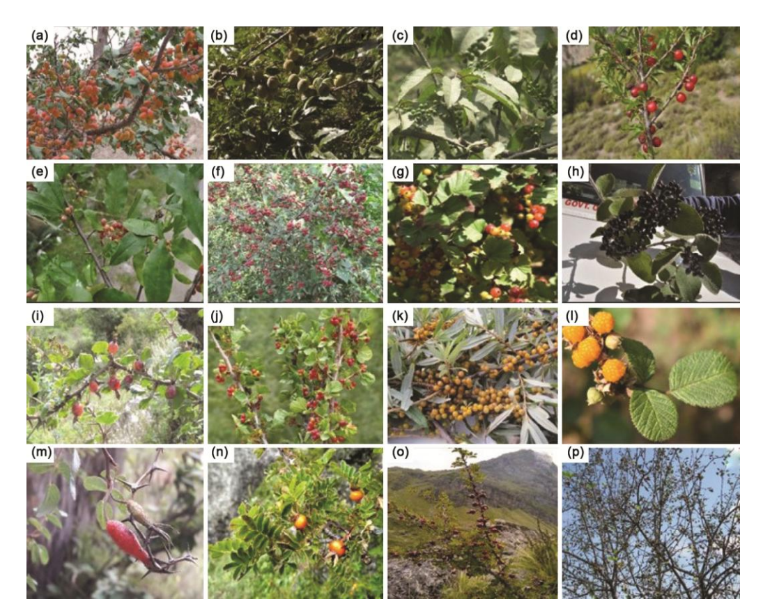
Fig. 3 — Photograph of collected wild edible fruits from study area: a- Prunus armeniaca L., b- Prunus mira Koehne, c-Prunus cornuta (Wall. ex Royle) Steud., d- Prunus jacquemontii Hook. f., e- Elaeagnus parvifolia Wall. ex Royle., f- Pyracantha crenulata (Roxb. ex D.Don) M. Roem., g-Ribes orientale Desf, h- Viburnum cotinifolium D. Don, i- Ribes alpestre Wall. ex Decne., j- Ribes alpinum L., k- Hippophae salicifolia D. Don., l- Rubus ellipticus Sm, m- Rosa macrophylla Lindl., n-Rosa webbiana Wall. ex Royle., o-Rosa sericea Wall. ex Lindl., p- Pyrus pashia Buch.-Ham. ex D. Don.

tuberosum), buckwheat (Fagopyrum tataricum and F. esculentum), two and six rowed barley (Hordeum vulgare and H. himalayense), amaranth (Amaranthus paniculatus), etc. are grown in their small farmlands and some potential wild/semi-wild plants like Allium spp."Pharan"; Carum carvi/ Bunium persicum "Siyajira"; Angelica glauca "Choru" "Gandrain"; Phytolacca acinosa "Jarag" and several other emergent medicinal plants in their kitchen gardens. Produce from wild/semi-wild herbs including Cordyceps sinensis "keedajadi" (Fig. 4f), collected from high altitudes fetches high price<sup>23</sup> are also sold in local markets as a source of income. Presently, apple cultivation has also been started by a few farmers in the valley.