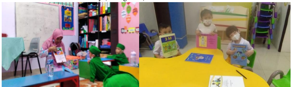
Figure 2: children are reading a book about the environment

Researchers in the third phase made observations on learning in early childhood classes to see the improvement of teachers' abilities in developing environmental education and children's literacy. The activities outlined in this paper are reading activities to improve children's environmental literacy (see figure 2).