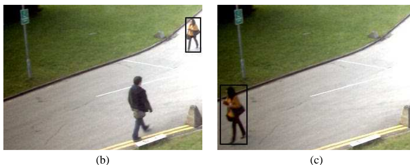
Figure 1. The effect of perspective on the number of detected interest points. In a) it is reported the graph of the number of SURF points associated to the person denoted with the box in a video sequence whose first and last frames are shown in b) and c).

the number of people is estimated from the number of moving corner points assuming a direct proportionality relation.