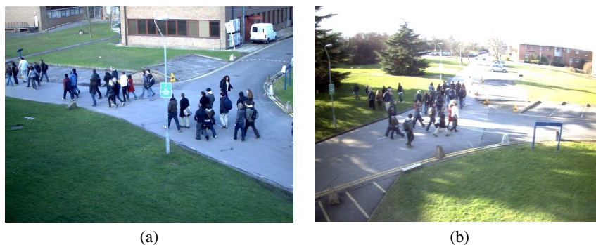
Figure 2. Examples of the frames of the video sequences used for the test: a) S1.L1.13-57 (view 1), b) S1.L2.14-31 (view 2)

For all the sequences we calculated the number of people in the whole frame.