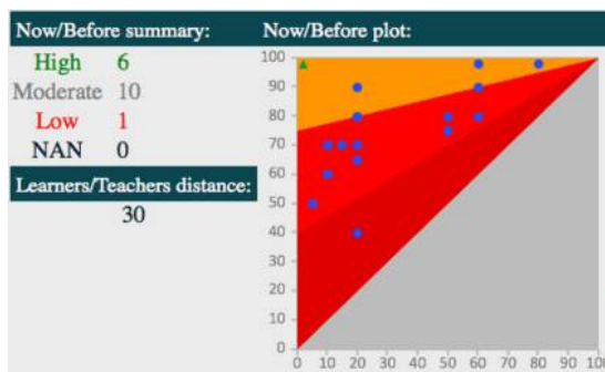
Figure 2. Graphical view of QC results, comparing self-perception by learners and trainers evaluation for a single unit of competence

The SR dimension refers to the learners' satisfaction with the training. It consists in the questionnaire usually submitted by the training office at the end of each training, in which learners are invited to express their perceptions of several training issues (such as setting, teachers and timing). Because it is a consolidated process in most organizations,