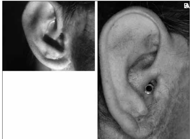
Fig. 2. A: External auditory canal (EAC) diameter two weeks after the end of RT (2 mm), the tympanic membrane is not visible; B: 4-mm stretcher placed in the right EAC: it can be seen that it is self-retaining and aesthetically pleasing as it does not protrude from the EAC.

The second patient who was treated with an ear stretcher was a 90-year-old man who underwent surgery in August 2013 for a squamous cell carcinoma of the ear infiltrating the skin and the external part of the parotid gland. A subtotal amputation of the ear was performed, maintaining only the bony portion of the EAC with its skeletonisation up to the TM. Adjuvant RT was excluded because of the patient's general condition. To avoid local complications, in the operating room we covered the residual bony canal with a temporal muscle flap over which we positioned a silastic foil with a Pope wick inside. Finally, the skin defect was closed directly. One week after surgery we in-