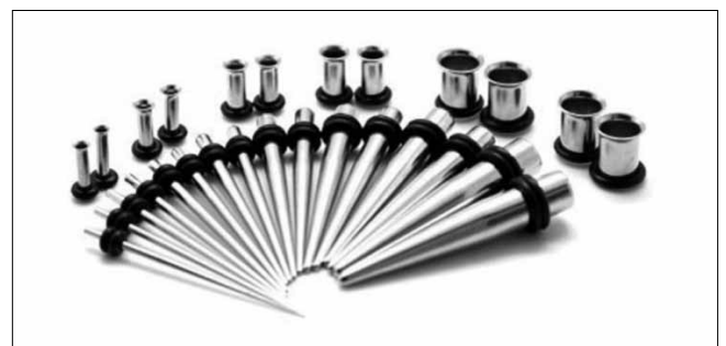
Fig. 1. Commercially-available ear stretching kit including surgical steel tapers and tunnels of increasing gauges.

In July 2012, a 47-year-old Caucasian man was referred to our ENT Department by his general practitioner because of a sudden increase in volume of a lateral neck mass, which had developed three months earlier. The mass was painless, located behind the right rising branch of the jaw, 30–40 mm in size, with a parenchymatous texture, fixed to deep tissues and covered by normal skin. Fine-needle aspiration biopsy (FNAB) of the mass was positive for squamous cell carcinoma. The patient underwent further investigations consisting of panendoscopy of the upper aerodigestive tract, computed tomography (CT) and magnetic resonance imaging (MRI) of the head, neck and chest, total body positron emission tomography (PET)-CT, and electroneurography (ENG) of the facial nerve. Clinical-radiological staging was right parotid carcinoma with EAC erosion and dermal infiltration. Therefore, a right radical parotidectomy and ipsilateral modified radical neck dissection type III (levels II–IV) were carried out. The tumour was leaning against the EAC, adherent to the cortical mastoid and the bony part of the EAC. These structures were drilled for oncologi-