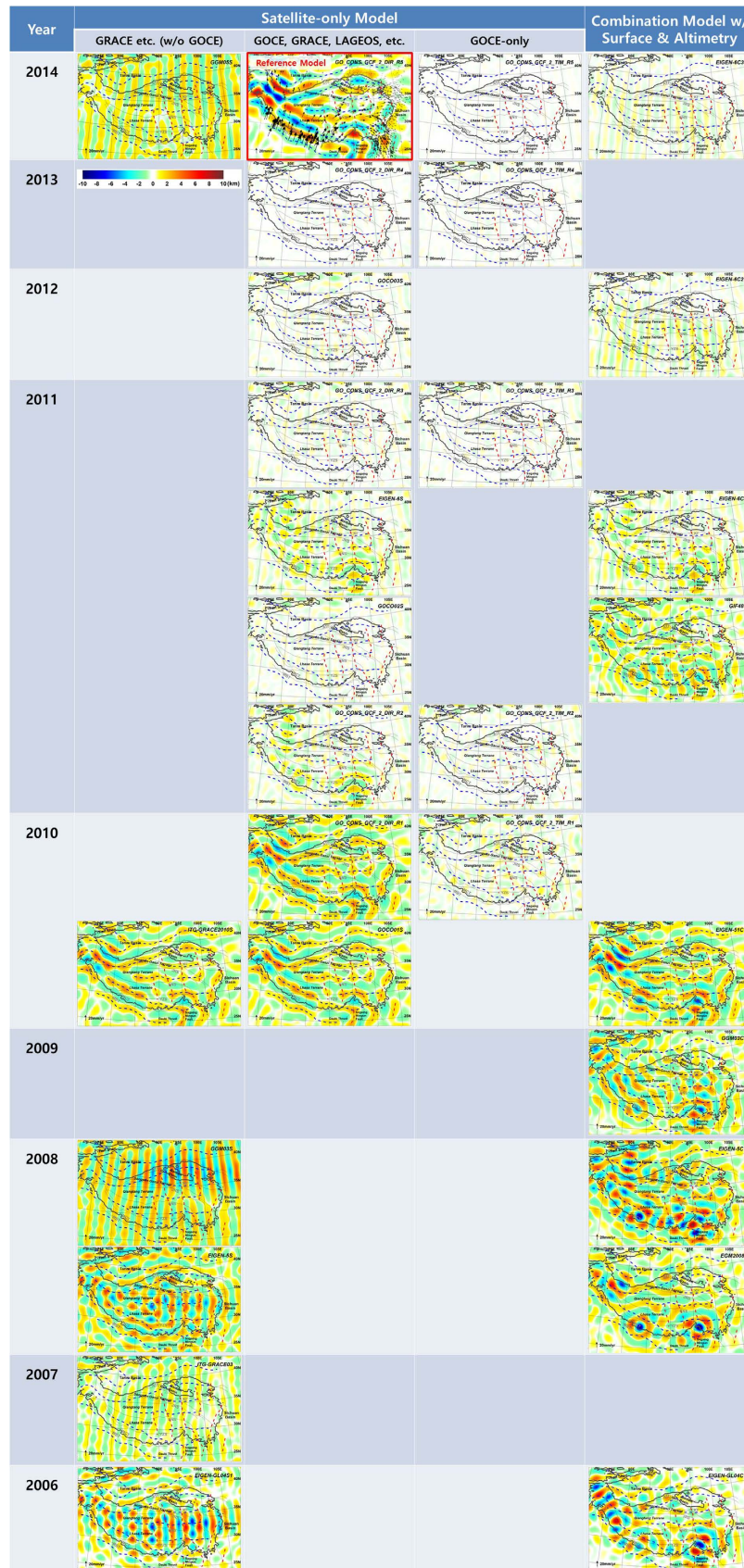
Figure 3. Difference of Moho fold models of various global gravity models with respect to that of GO_CONS_GCF_2_DIR_R5 (Reference Model). (The figure is generated using Surfer ( http://goldensoftware.com/ ) by Young Hong Shin).