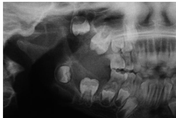
Fig. 2. Panoramic radiography details. Large radiolucent area in the right mandible, deformity of the condylar head, and displacement of the first molars.

orthodontic variables were evaluated: molar relationship, OJ, OB, cross-bite, scissor bite, and arch length discrepancies. According to our results, a significant difference ( p = 0.01 ) between the prevalence of class III molar relationship in healthy children (6.08%) and in children with NF1 (15.6%) was observed. As regards the OJ, no statistically significant difference between the two groups was found, but the results show that the number of patients with a reverse OJ was more than double in the NF1 group than in the control group.