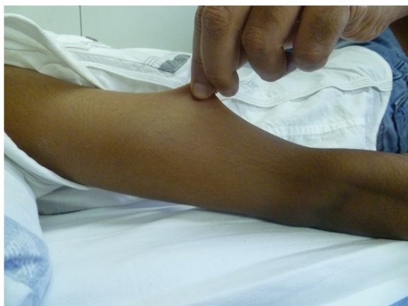
Fig. 4 Skin hyper extensibility in a child with EDS subtype hypermobile

TNX-B, encoding for Tenascin X, in approximately 5 % of patients with the hypermobility type, while vascular EDS is caused by heterozygous mutations in the COL3A1 gene, encoding type III collagen [23, 24].