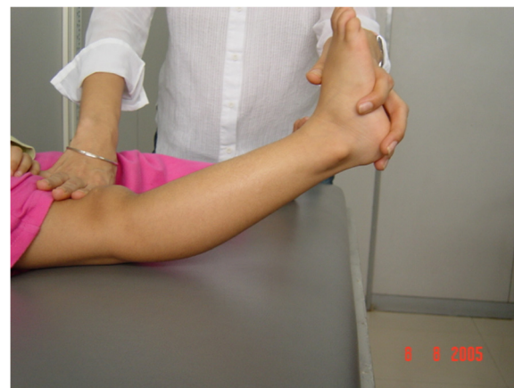
Fig. 3 Hyperextension of the knee in a child with BJHS

mentioned, the Health Related Quality of Life in children with hypermobility and their parents may be worse than that of healthy controls and this may well be secondary to the presence of chronic pain and fatigue, that act as stressors in everyday life. This is an important aspect to consider for physicians approaching a child with BJHS, that should not underestimate the burden of this condition, often interpreted as benign and not worth any intervention [3].