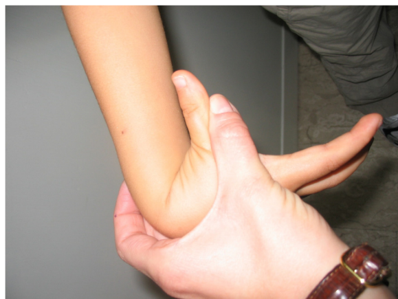
Fig. 1 Passive apposition of thumb to the flexor aspect of forearm in a child with BJHS