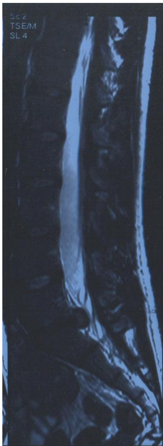
Figure 1 . Lumbosacral spine MRI.

Eur J Trans Myol - Basic Appl Myol 2014; 24 (3): 203-207