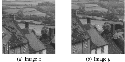
Fig. 2. Example of 256x256 x and y images cropped from the 512x512 “goldhill” image. Here we have r = 21 , c = 36 and n_x and n_y are independent white gaussian noises with \sigma_{n_x} = \sigma_{n_y} = 2 . In this case 69 bits suffice to correctly detect the shift with the computationally light decoder (in less than 1 second), while 39 bits suffice in the case of the complex decoder (in more than 300 seconds).

phase is affected by both r and c . So, if instead of using only the coefficients associated to vertical and horizontal frequencies, as in eq.'s (4), (4), we also consider “diagonal” frequency phases of the form \Phi_X(N/2^i, N/2^j) , we actually add some sort of “parity-check” to the code.