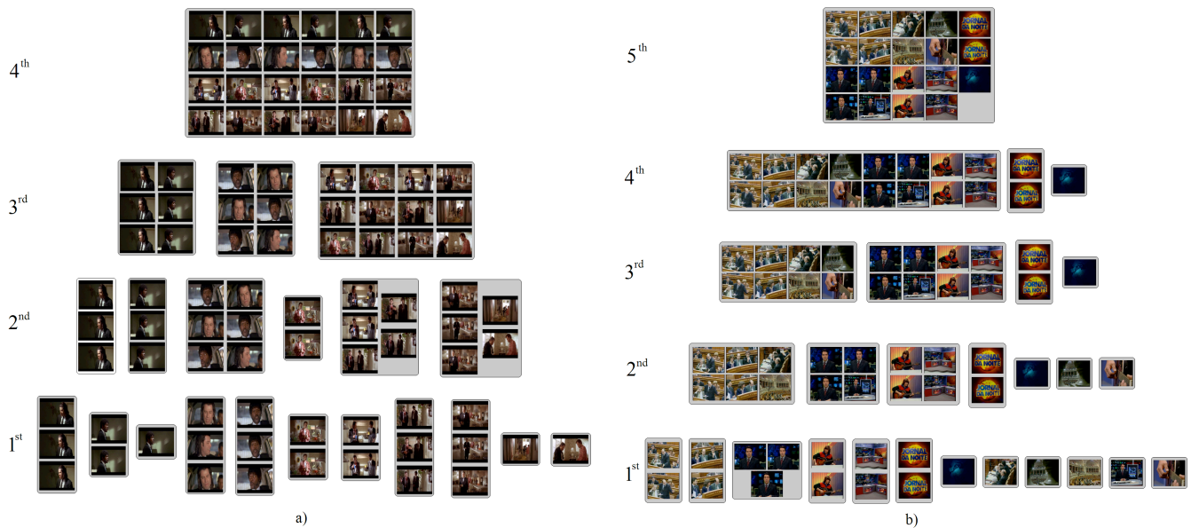
Fig. 2 Hierarchical summaries for a) Pulp Fiction movie and the b) Portuguese News programme.

hours of video. Using the cluster validity analysis as in [6] the optimal summary is chosen, and building upon this, a segmentation into Logical Story Unit (LSU) [5] is obtained. To evaluate our performance appropriately we use the Coverage and Overflow criteria proposed in [10]. The measurements are presented in Table 1, where low values of Overflow and the high scores of Coverage reveal the good performance of the proposed clustering algorithm at the optimal summary level.