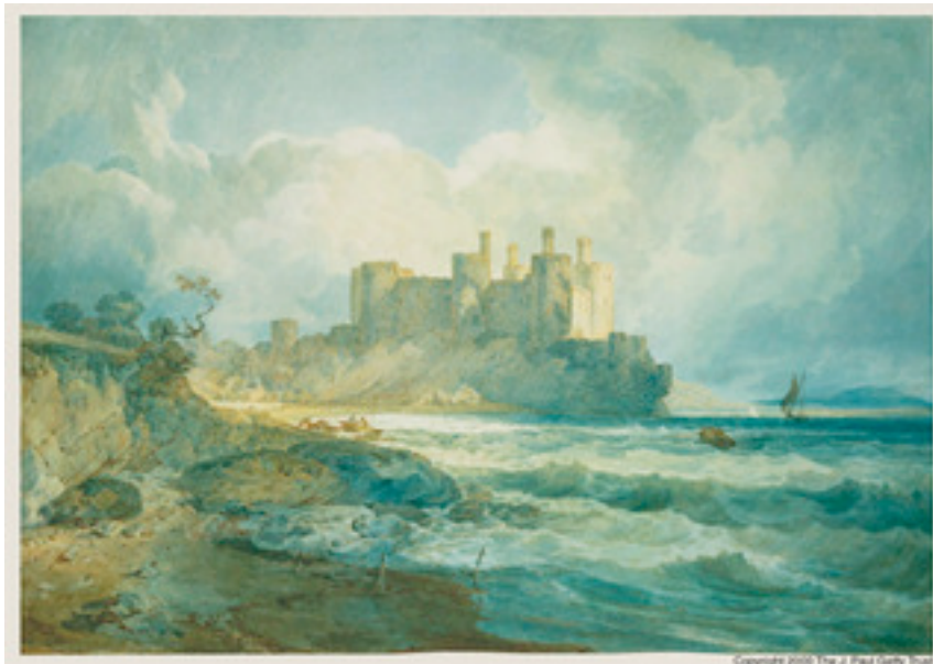
Figure 6: Watercolor drawing (watercolor_drawing.gif).

The Getty description of the painting shown in Figure 6 and the mapping of the description to MPEG-7 are included in this section.