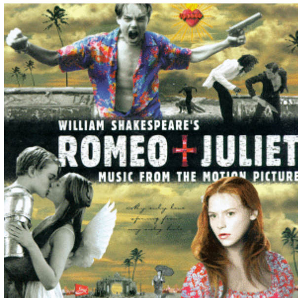
Figure 4: Album CD of the soundtrack of the movie "Romeo + Juliet".

The following example illustrate the use of the Semantic DS for describing the music album CD, whose front cover is shown in Figure 4. The description of the music album CD involves multiple narrative worlds corresponding to the album CD, the contents the picture on the album's front cover of the album, the contents of the picture on the disc's front side, and the content of each song. In this example, the album is represented by an object that is composed of a cover, a booklet, and a disc object. The cover object consists in the front and the back cover object. The disc object is composed of the disc's front side and the back side objects; the disc's back side consists of cuts corresponding to songs.