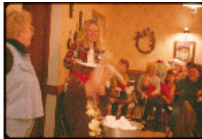
Figure 7: Bay shower (baby_shower.gif).

The LC description of the photograph shown in Figure 7 and the mapping of the description to MPEG-7 are included in this section.