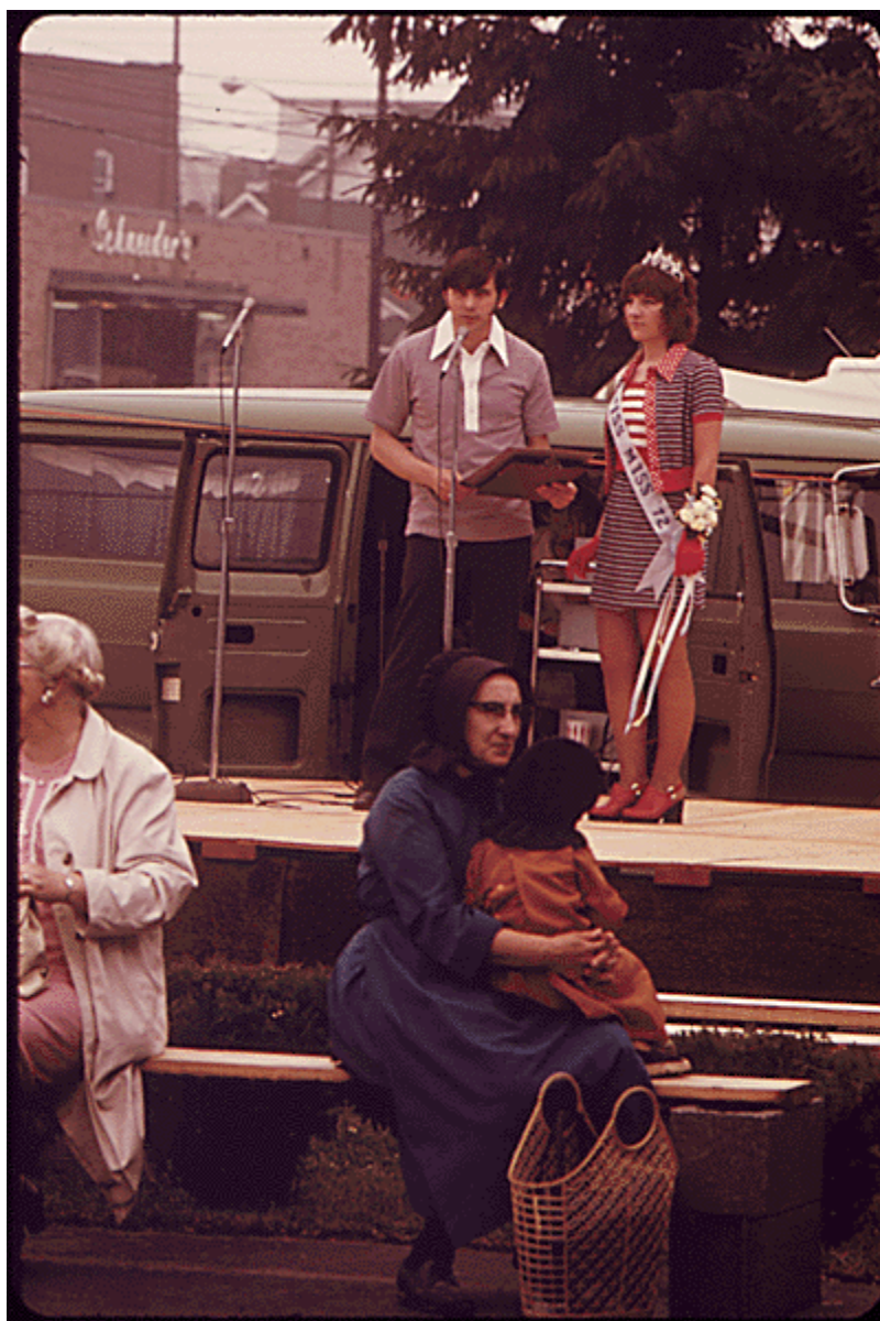
Figure 8: Beauty Contest (beauty_contest.gif).

The LC description of the photograph shown in Figure 8 and the mapping of the description to MPEG-7 are included in this section.