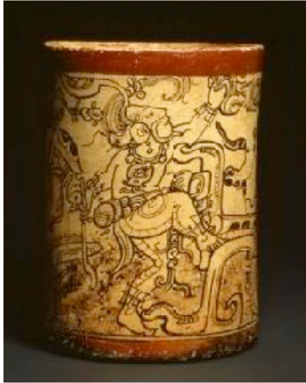
Figure 5: Maya vessel (maya_vessel.gif).