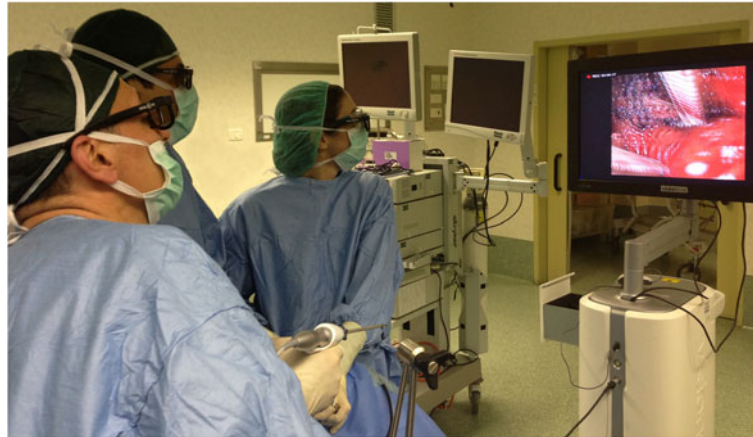
Figure 1 Minimally invasive video-assisted thyroidectomy. A view of the setting (endoscope, video camera and glasses) used for the 3D-MIVAT.

findings, technical aspects, operative time, rate of conversion into conventional technique and complications. The degree of difficulty of the 3D MIVAT technique was graded by the surgeon using a 5-point subjective scale, ranging from 5 (very easy) to 1 (very difficult) in order to recognize the upper and lower vascular pedicles, the parathyroids, the superior and inferior laryngeal nerves. Patients were asked to report their opinion according to the cosmetic results and postoperative pain. Cosmetic results were graded using a 4-point scale, ranging from 1 (very happy) to 4 (unhappy), while postoperative pain was evaluated by a visual analogue scale (VAS) from 1 (no pain ever) to 10 (worse pain).