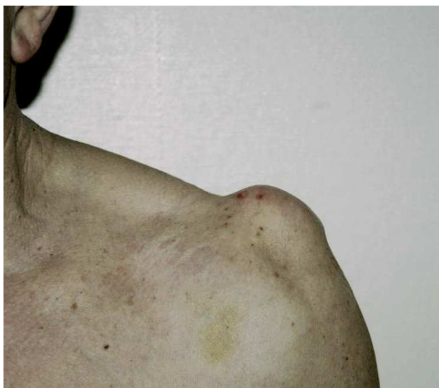
Figure 1. Preoperative image of the fistulized acromioclavicular joint cyst.

Plain X-ray examination of the left shoulder showed ACJ degeneration, with acromioclavicular (AC) space narrowing and osteophyte formation, proximal migration of the humeral head and osteoarthritis of the gleno-humeral joint (Figure 2). Further MRI evaluation confirmed the clinical diagnosis of a complete rotator cuff tear and observed a large, well-defined subcutaneous cyst in communication with the degenerative ACJ (Figure 3). Culture of the synovial-like fluid was negative and white