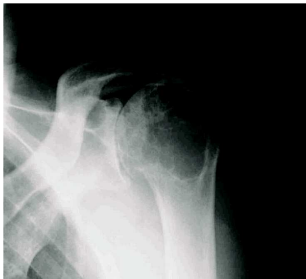
Figure 2. Preoperative shoulder X-ray.