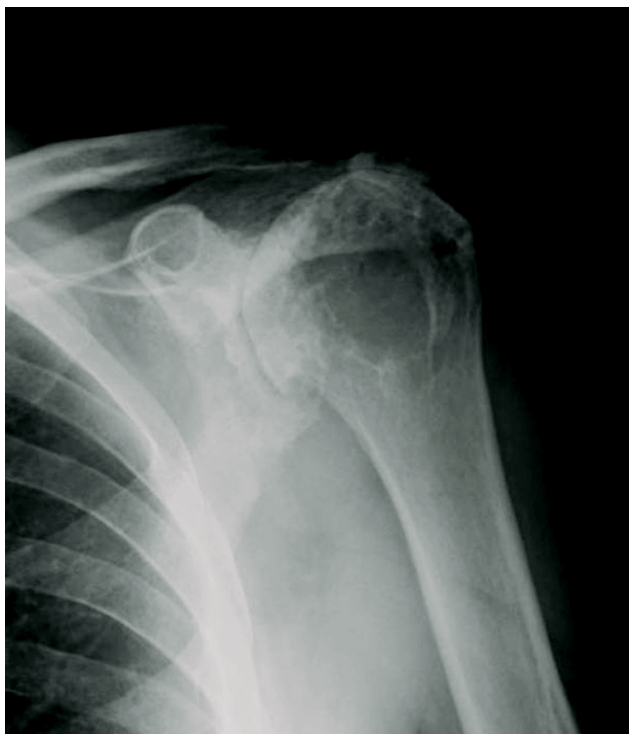
Figure 4. Postoperative shoulder X-ray.

blood cell count, erythrocyte sedimentation rate and reactive C-protein were within normal limits.