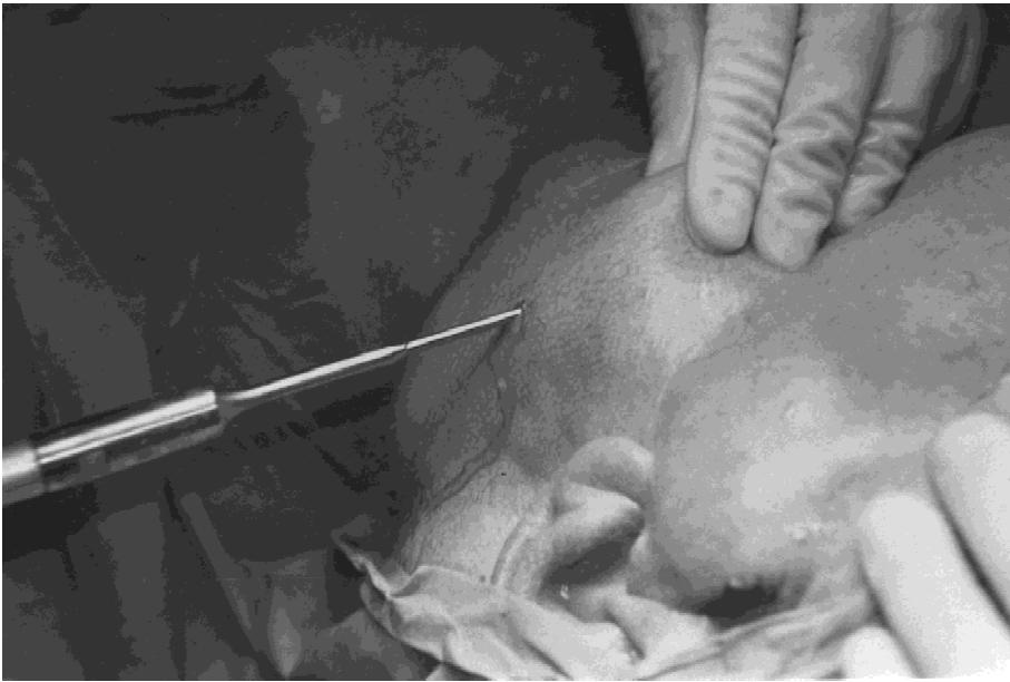
Fig. 2. I.O. view: ultrasound probe introduced into the left laterocervical region. Liquefied fat is flowing out.

cosmetic result, but the aerodigestive symptoms improved significantly and the patient was satisfied.