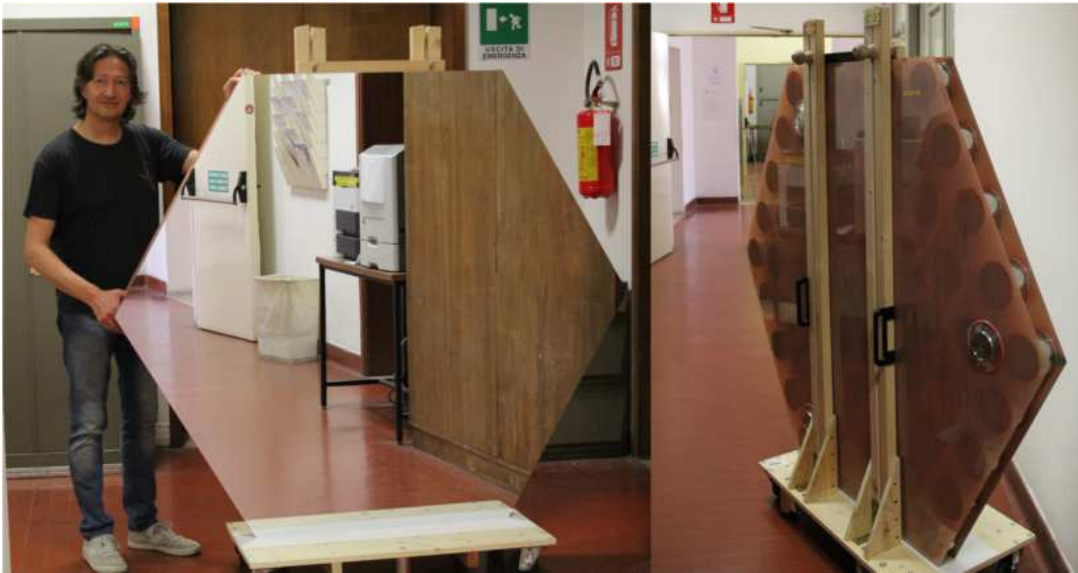
Figure 3: Front (left) and rear (right) of one of the first 1.5 FTF diameter mirror prototypes proposed to be used for the LST.