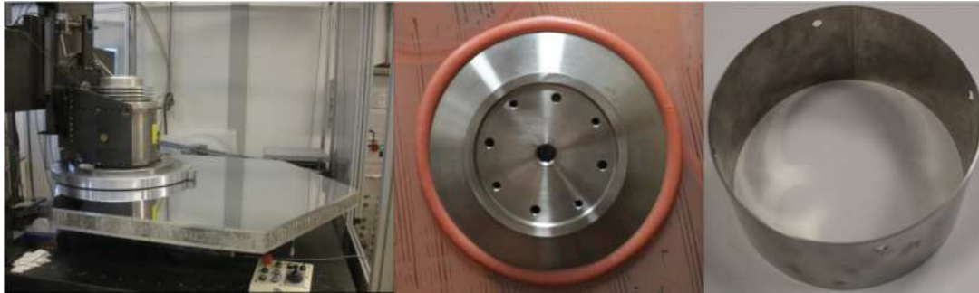
Figure 1: Left: Diamond-milled 1.5 FTF diameter aluminum mold. Center: Pad for the active mirror control attachment. Right: Image of a stainless steel cylinder.

The multilayer glass composite mirror has an open structure design and consists of a thin rear and front glass multilayer interspaced by steel cylinders. In such way, the mirror is rigid and light-weight at the same time. The technique is based on the curvature replication under low pressure from a convex diamond-milled aluminum mold (Figure 1 left panel), with a nominal radius of curvature of (57.9 \pm 0.5) m a microroughness of < 30 nm.