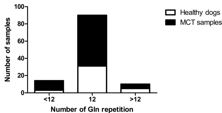
Fig 2. Association between the number of glutamine (Gln) repetitions and healthy/pathologic state in 114 canine blood and MCT samples. Pearson \chi^2 test ( p = 0.3454 ; not significant).

No mutations were identified in IDH1 and IDH2 genes in our cohort of MCTs while, in SM, IDH2 mutations occurred for 6.9% of cases [11]. To the best of our knowledge, only one