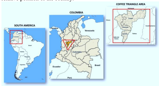
Figure 1. Study area, Coffee Triangle Region of Colombia and relative position of the country.

For this study, the epidemiological data was collected from the surveillance system, obtaining the number of cases for each municipality by year (2007-2011). Data was obtained with agreement from the Colombia Ministry of Health through the Protection Information System (SISPRO), through a Client Access server which allowed retrieving cases from the SISPRO server to a local computer. The SISPRO surveillance data used for this study are constituted from confirmed cases, which have been revised in terms of data quality, initially from data from the National Institute of Health of Colombia and later by the program SISPRO and its Data Cubes system. The information for this study from 53 primary notification units, one per municipality, later consolidated in three secondary notification units, at department levels, and finally centralized in Bogotá with the SISPRO system. Quickly revised and consolidated information is available for the years 2007 to 2011.