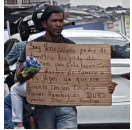
Figure 3. Venezuelan migrants in Colombia asking for money at streets (Pereira, April 2, 2019).

In conclusion, there is an increase in the demand for health services by migrants from Venezuela in the receiving countries. This tendency is observed concerning multiple health problems and the mechanisms involved are difficult to quantify but they seem to be the result of different aspects of the humanitarian crisis. This issue represents a public health alert that requires prioritization by the international community for a multisectoral approach.