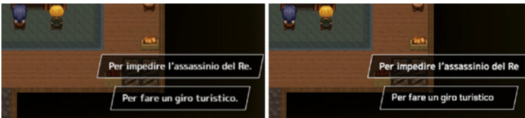
Figure 12 Selection box text with a period at the end in the first revision on the left, and without, in the second revision on the right

The text styles in Unsung Kingdom are quite diverse. There are full-screen texts (for example, for the game’s introduction and each chapter), texts in dialogue areas, texts in the personal menu, texts above enemies and weapons, and texts in small boxes for selecting answers. Answer selection boxes appear frequently in Unsung Kingdom , even though selecting an option changes the dialogue between characters for only a few lines. When the translation was first revised, all sentences in the answer selection text were followed by a period. It is common practice to end a sentence with a period, but the best practice guidelines for user interfaces recommend avoiding the use of punctuation in dialogue and choice selection boxes (The Mattermost staff 2020; The Qt Company 2020; Microsoft 2018), and indeed the presence of the period in the selection boxes is quite disturbing, as shown in figure 12 [fig. 12].