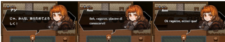
Figure 9 Mod. 1. Japanese text, first Italian translation and revised translation

So, after revising with the students, a translation came out that, although far from the original, better conveys the idea of the characters having just arrived: “Ok ragazze, eccoci qua” (Ok girls, here we are).