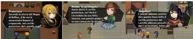
Figure 4 Rev. 1. Game Introduction 1. Off-screen text