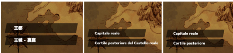
Figure 8 First map of the game. Japanese, Italian (rev. 1), Italian (rev. 2)

A problem with texts being too long also occurred with the translations of the map texts. In the case of the figure below, the Italian exceeded the dedicated area because the system does not automatically enlarge it or set automatic line breaks [fig. 8]. Therefore, even in this case, it is necessary to evaluate which part of the text is most needed by the player. The original Japanese text is formed by 2 kanji compounds: the first one ōjō 王城 means ‘Royal Castle’, while the second one uraniwa 裏庭 means ‘back courtyard’. Even in this case, playing the game makes it clear that the information the player needs most is ‘back courtyard’, and so the text has been retranslated into Italian accordingly.