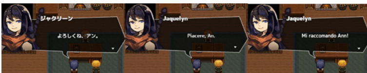
Figure 10 Dialogue 2. Japanese text, first Italian translation and final translation

Similarly, the second dialogue, “ Yoroshiku ne An よろしくね、アン”, was translated as “ Piacere, An ” (Nice to meet you, Ann), in accordance with the previous Italian dialogue. In this case, too, when the students understood the context of the usage, they were able to change the translation according to the story: “ Mi raccomando Ann! ” (Be careful, Ann!).