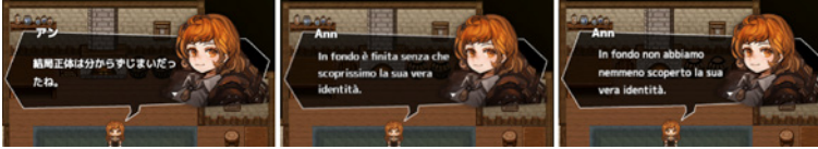
Figure 11 Japanese text, first Italian translation and final translation

without us finding out his true identity) is not grammatically incorrect. However, this “è finita” (it is ended) is misleading for the player. Since this dialogue occurs in the first chapter and there was only one battle, which automatically ends with the defeat of the characters, it is difficult for the player to understand just what is ended. Therefore, also in this case, the sentence was simplified and made more concise: “In fondo non abbiamo nemmeno scoperto la sua vera identità” (After all, we haven’t even discovered his true identity) [fig. 11].