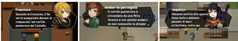
Figure 7 Rev. 2. The texts of Figure 6 have been revised and shortened

After analysing the translations from the first review by playing the game directly and projecting it in class, the students revised the translations as shown in figure 7 [fig. 7].