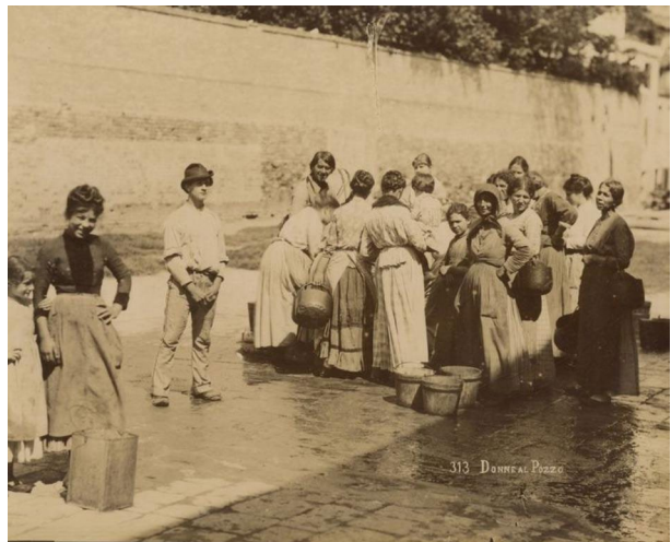
Fig. 5 "Donne al pozzo" (women at the well), post-card photograph by Venetian publisher-photographer Ferdinando Gobbato, early twentieth century. Note the presence of the capo contrada , dominating the scene

Domestic water was part and parcel of daily life. In a sixteenth-century case held before the Venetian Inquisition, a certain Clara recounts how she suspected her neighbour Angela of dubious behaviour, first spying on Angela from her balcony and later sending a manservant to ask Angela for water, as a pretext to enter her house (Chojnacka 2001, p. 68). Venetian probate inventories from the same period reveal the ubiquity of household implements to fetch, store, ladle out or wash with fresh water: large earthenware jugs for storage; copper buckets and ladles for drinking and cooking; brass pitchers, iron "fountains" and basins for washing (Palumbo Fossati Casa 2013, pp. 34–35, 75, 117–118, 179). They were variously listed as being in the kitchen, entrance hall and/or bedroom at the time of the notarised inventory, in line with their function. The lawyer Gaspare de Zanchi kept a "large water pitcher" ( uno pitter grande da acqua ) in a ground-floor storeroom, which held 20 secchi of water, or 214 L, according to an inventory of 1582 ( ibid. , p. 119). This sort of large water container must have been common in better-off households without easy access to their own cistern. The patrician Donato da Lezze had no such worries, with a well-head of his own in a small courtyard, where laundry was also done, to judge by the implements recorded there