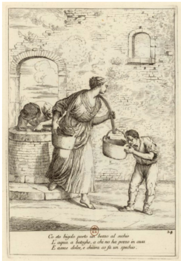
Fig. 6 A Venetian bigolante , as depicted by Gaetano Zompini (Zompini 1785, no. 24)