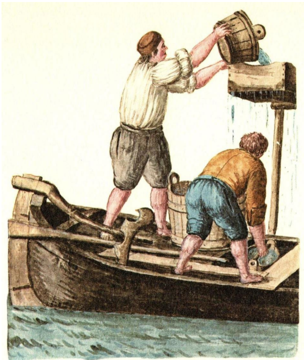
Fig. 2 “Deficienza proveduta” (shortage rectified) by the Flemish-Italian Giovanni Grevembroch (Jan van Grevenbroeck), showing two acquaroli at work. Watercolour, late-eighteenth century (Grevembroch 1981, IV: no. 63)