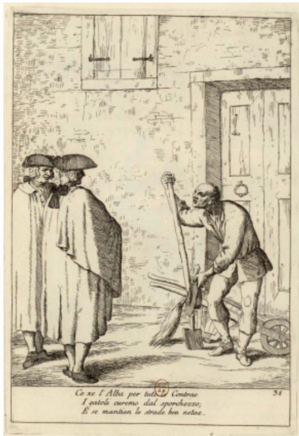
Fig. 4 A street-sweeper, with his spade, broom and barrow, as depicted in a series of etchings of Venetian itinerant trades by Gaetano Zompini (Zompini 1785, no. 38)

Trades were responsible for clearing the waste they produced, like the vegetable-sellers ( erbaioli ) who in 1522 pledged before the health officers to pay "Giacomo the bargeman"