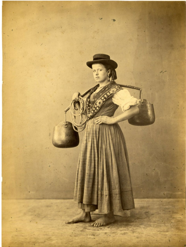
Fig. 7 Albumen print of a bigolante by photographer and optician Carlo Ponti, c. 1870, one of many he produced for the Venetian tourist market (Ponti 1870)