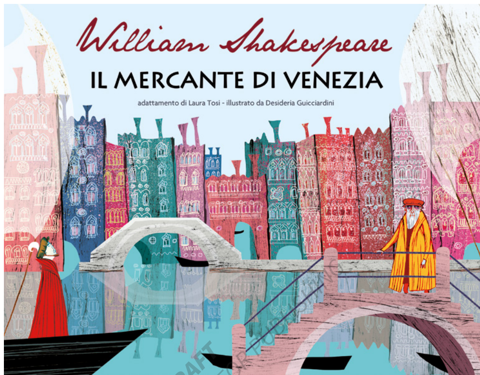
Figure 1 Caption