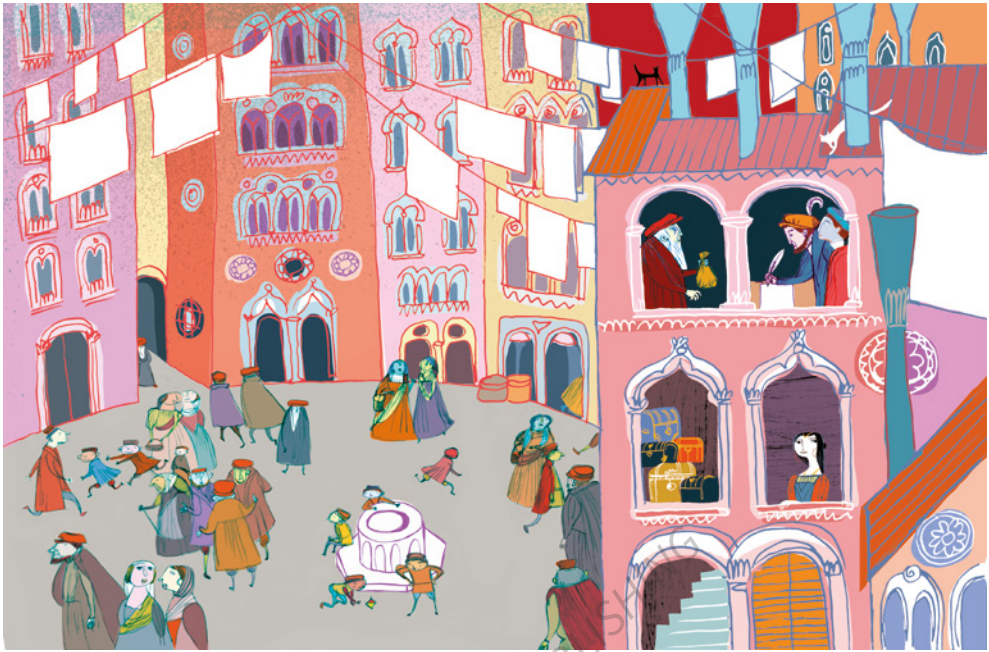
Figure 2 Caption

79). I decided to write a sequence to accompany Guicciardini's illustration that showed Antonio and Bassanio crossing a bridge and heading towards the Ghetto while, on the facing page, the illustration looked through a partially closed gate onto a busy campo , crowded with people dressed very differently from the Venetians the reader had seen so far. I wanted to explain what it meant to be a usurer in Venice and to describe the architectural peculiarity of the place, the tall buildings, that the child reader could see on the page. Lending money was one of the only jobs the Jews were allowed by the Republic of Venice, and their confinement to 'una zona' that segregated them and restricted their living space to a single small island meant that there was no space to build more houses, so houses had to rise taller to accommodate as many people as possible. The description of the houses and of the curfew imposed on the Jews and its implications builds the illusion of time passing: as this explanatory passage comes to an end, Bassanio and Antonio have 'arrived' and are ready to meet Shylock.