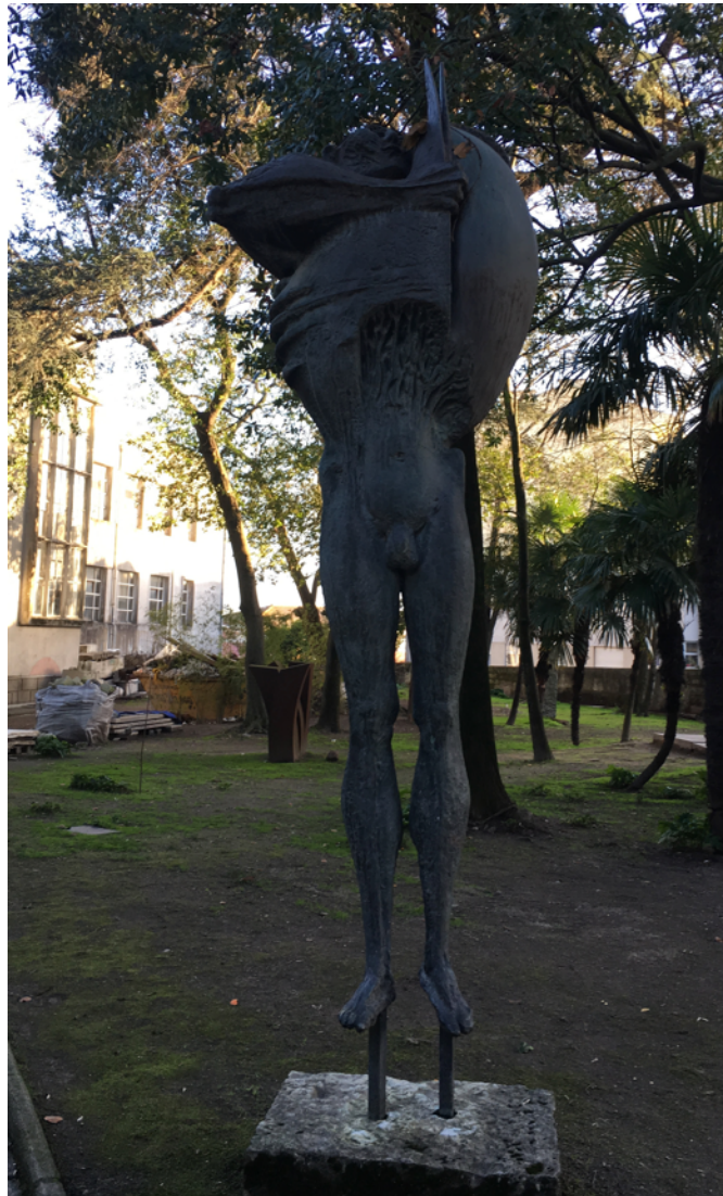
Figure 1. O guardador do Sol (1953) by José Rodrigues, bronze, in MFBAUP, one of the selected sculptures studied in BIONANOSCULP.

Stone- and modern materials-based sculptures: Rosalía de Castro (1951) by Salvador Barata Foyo, pink granite, in Praça da Galiza, Massarelos, Porto; Sol, Lua e Vento (1997) by Satoru Sato, grey granite, in MIEC; Afonso de Albuquerque (1930) by Diogo de Macedo, limestone, in Largo de D. João III, Lordelo do Ouro, Porto; Movimento (1994) by Augusto Jorge Ulisses, marble, in MFBAUP; Repouso (1953) by Gustavo Bastos, cement mortar, in MFBAUP; O guardador do Sol (1953) by José Rodrigues, bronze, in MFBAUP (Fig. 1.) and Eu espero (1999) by Fernanda Fragateiro, stainless steel, in MFBAUP.