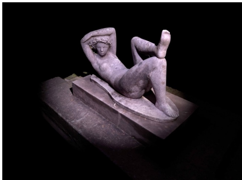
Figure 2. 3D model of Repouso (1953) by Gustavo Bastos, in MFBAUP, one of the selected sculptures studied in BIONANOSCULP.

Nowadays it is also crucial to establish a knowledge database that includes 3D virtual models that can help explaining the objects [3]. These modeling process is important for mapping the state of biodeterioration and biocontamination, allowing the aquisition of details by the viewer that with a 2D image is not possible, namely in interfaces of materials and different surfaces. The data acquisition technique used is a type of photogrammetry, the structure from motion (SfM) technique. The photogrammetric 3D model was generated using Agisoft Photoscan® ( http://www.agisoft.com/ ). This type of acquisition has the advantage of producing a photorealist 3D models of the sculptures. This characteristic is very important for mapping with accuracy the several locations where the nanomaterials will be tested. The photogrammetric models are then post-processed with Blender, a free and open source 3D creation suite software with GNU General Public License ( www.blender.org ). Figure 2 depicts a 3D model of Repouso (1953) by Gustavo Bastos.