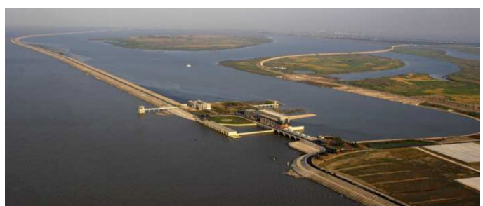
Figure 12. The water intake station of Qingcaosha Reservoir