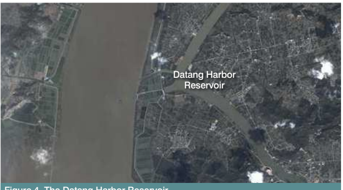
Figure 4. The Datang Harbor Reservoir