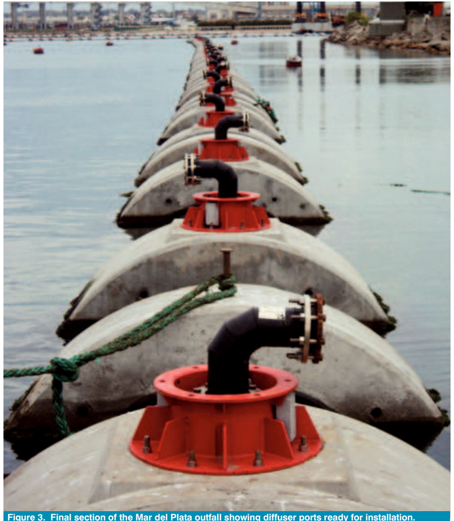
Figure 3. Final section of the Mar del Plata outfall showing diffuser ports ready for installation.

As a result of participation in Marine Waste Water Disposal (MWWD) conference in 2006 [19], a fruitful collaboration between OSSE and