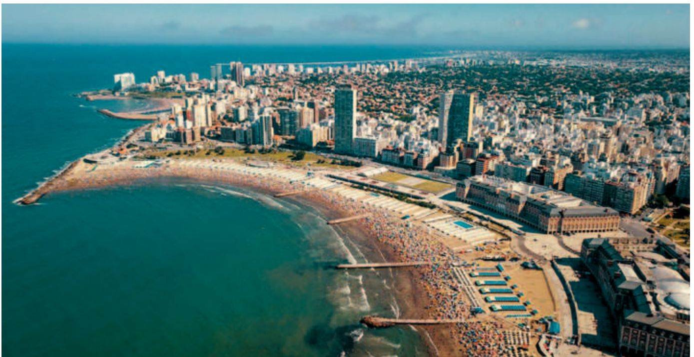
Figure 1. Aerial view of Mar del Plata's beaches.

We would like to highlight the immediate improvements of the recreational water quality of Mar del Plata since the commencement of the submarine outfall operation. Fig. 2 presents 30 years of enterococci monitoring in Mar del Plata's beaches. It can be readily seen that the water quality standards for indicators of fecal contamination were met almost immediately following the outfall construction. For example, at Delicias Beach approximately 0.9 km from the discharge, the monitored enterococci concentrations reduced considerably from 50,000 to 27 entoro-