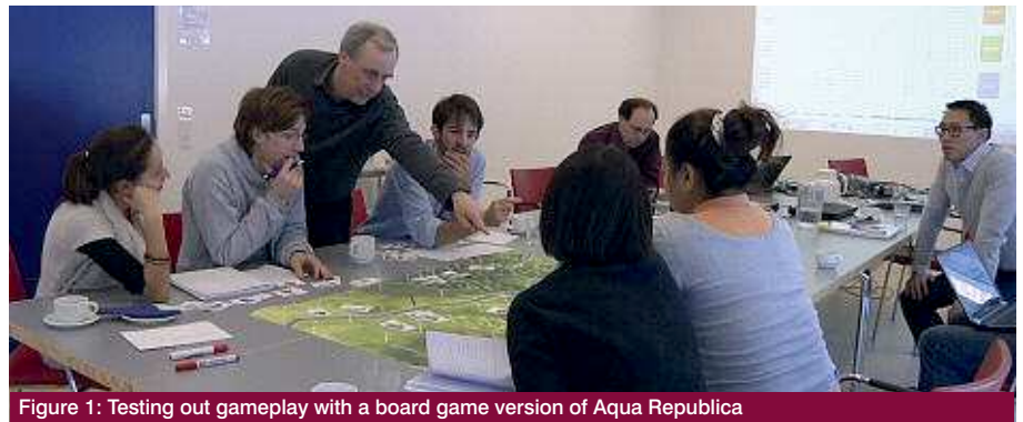
Figure 1: Testing out gameplay with a board game version of Aqua Republica

This learning by playing approach is commonly termed as “meaningful play” and a well-designed serious game environment provides a feedback mechanism that allows the player to