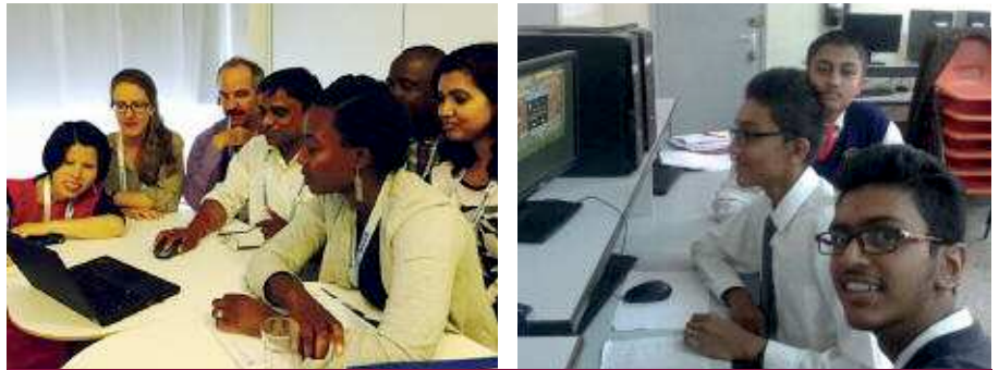
Figures 4 and 5. Participants trying their hands on the Aqua Republica game at Stockholm World Water Week and Students in Kenya playing the Aqua Republica game as part of a workshop

To date, there are many different unique versions of Aqua Republica developed to teach different aspects of water and environment management to different groups of stakeholders, ranging from food-energy-water nexus issues for water users in New Zealand, to water security issues for the Government of Singapore. Aqua Republica has also been successfully used in many other educational activities, such as the annual UNEP-DHI Eco Challenge competition, where more than 7000 students have participated since 2013, the World University Challenge, as well as part of Master and Bachelor programmes around the world. In addition, Aqua Republica has also been used in research projects where the objective is to continuously seek improvements on how to better use this technology to reach out to even more people.