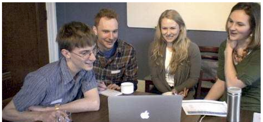
Figure 6. MSc students in McGill University, Canada using the Aqua Republica as part of an IWRM course