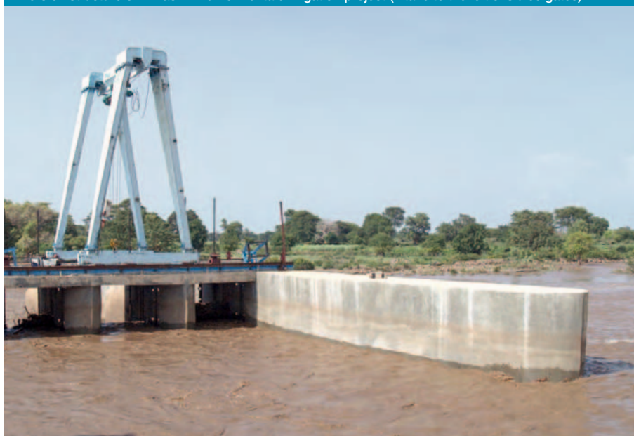
Diversion structure on Awash River for Fentale irrigation project (intake to the left of sluice gates).