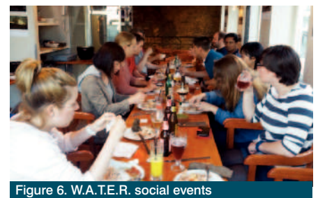
Figure 6. W.A.T.E.R. social events