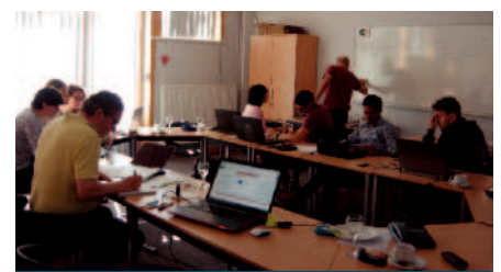
Figure 5. Session of data processing and discussion of results