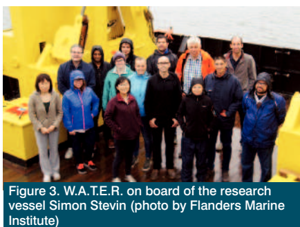
Figure 3. W.A.T.E.R. on board of the research vessel Simon Stevin