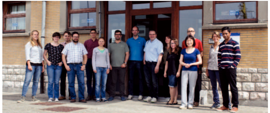
Figure 1. W.A.T.E.R. group photo in front of the Flanders Marine Institute