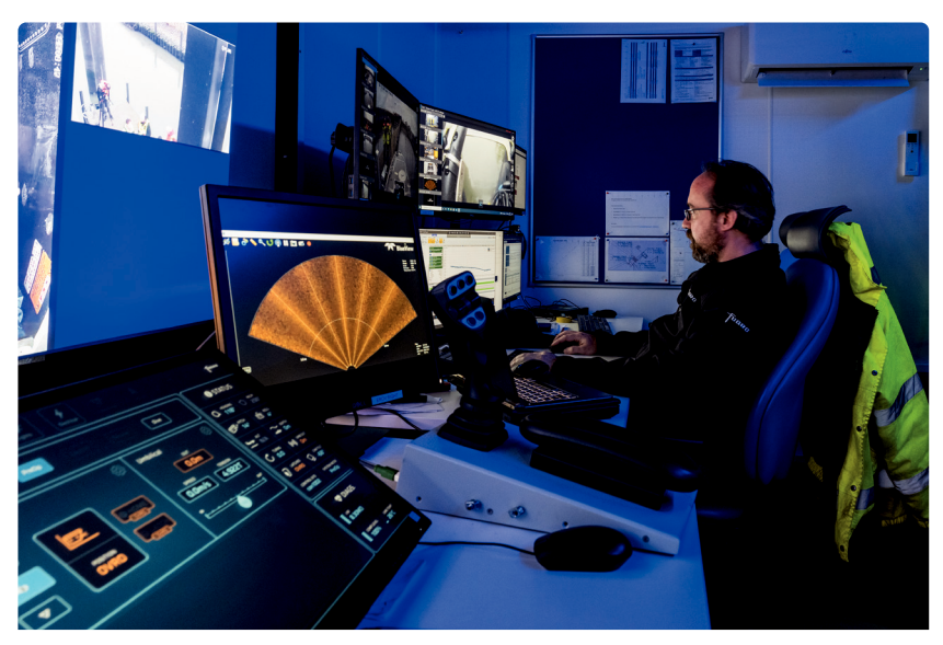
Fig. 4: Operational control of the USV is done from dedicated or mobile remote operations centres as well as quality monitoring of the acquired data

home or be in the remote operations centre running the vessel (Fig. 4)?