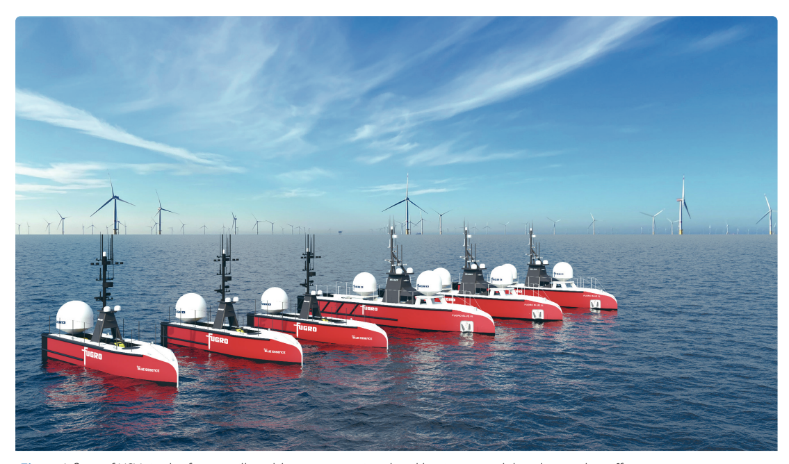
Fig. 5: A fleet of USVs in the future will enable new operational and business models to be used to offer on-demand and risk-based surveys

Since data streams from the USV and eROV are digitised and data delivery to clients can be done via cloud-based portals, the step towards advanced data analytics is relatively small. Algorithms can identify trends through year-on-year comparison allowing for surveys to be proposed on a risk-based methodology. This offers significant efficiency improvements compared to traditional methods where certain areas are surveyed or inspected on a routine basis. As the USV fleet grows (Fig. 5), the