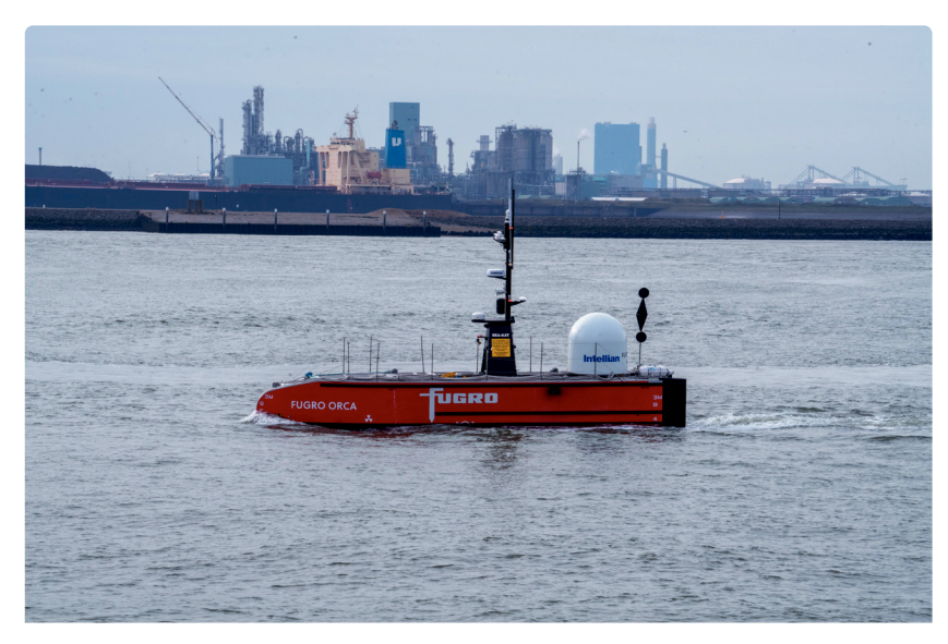
Fig. 1: Blue Essence sailing out of the Port of Rotterdam for its first commercial project

Another challenge was monitoring and maintenance of the vessel, the eROV and the sensors for data acquisition. Normally, crew are able to recognise vessel or equipment faults, or respond to breakdowns, but with an uncrewed solution the technology needs to be monitored in real-time from a remote operations centre. This resulted in a complete redesign of the vessel system, including an internet of things environment, leading to new systems for troubleshooting, propulsion and launch and recovery solutions. To do this, partnerships were established with technology companies with a known track record in building USV solutions that allowed integration of Fugro's survey and inspection technologies.