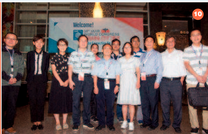
13. YPN Technical Visit to the Hydro-Electric Station. Activity organized by the Panama YPN