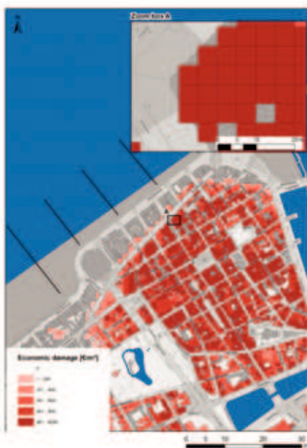
Figure 3. Flood risk calculation using the FLIAT model

Extensive laboratory tests to study wave impact on beach-dike configurations typical of the Belgian coast have been carried out (Figure 4).