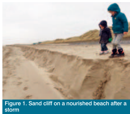
Figure 1. Sand cliff on a nourished beach after a storm

To improve the knowledge of the Belgian coastal system, researchers from knowledge institutes and private companies with great interest and expertise in physical coastal processes joined forces in 2015 and set up the CREST project.