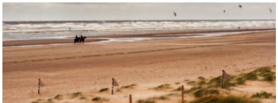
Figure 2. Aeolian sand transport campaign. On the foreground three Modified Wilson And Cook (MWAC) sand traps are visible.

It became also clearer that the road to efficient and accurate design of the optimized coastal defense systems of tomorrow involves a variety