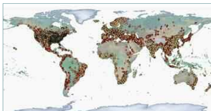
Figure 2. Location of the 58'000 large dams according to the ICOLD register ranging from medium size dams (up to 50 m high, shown in yellow) to very high dams (above 150 m, shown in red)