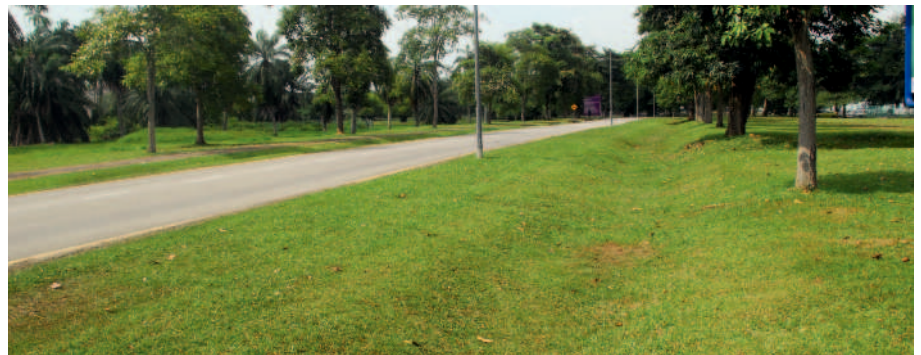
Figure 3. Ecological Swale

The research study on the capability of BIOECODS in managing stormwater runoff in the 320-acres catchment area of the Engineering Campus has been carried out since 2003. In terms of both quantity and quality, it has been proven that BIOECODS is able to minimize hydrological changes in a catchment area. In addition, contaminated