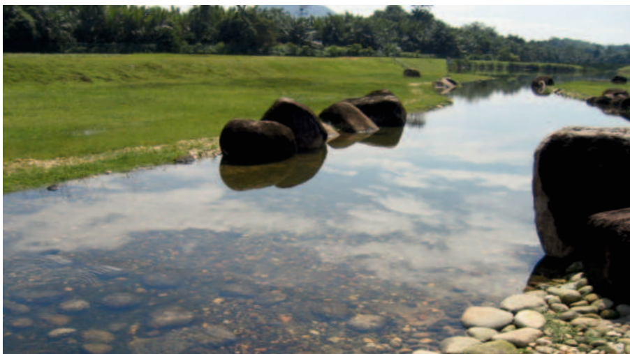
Figure 4. Ecological Pond (Wading River)

stormwater can be cleansed, the amenity value at USM Engineering Campus can be improved by promoting natural processes such as infiltration, flow retardation, storage and purification before discharging the treated stormwater at the downstream end of River Kerian.