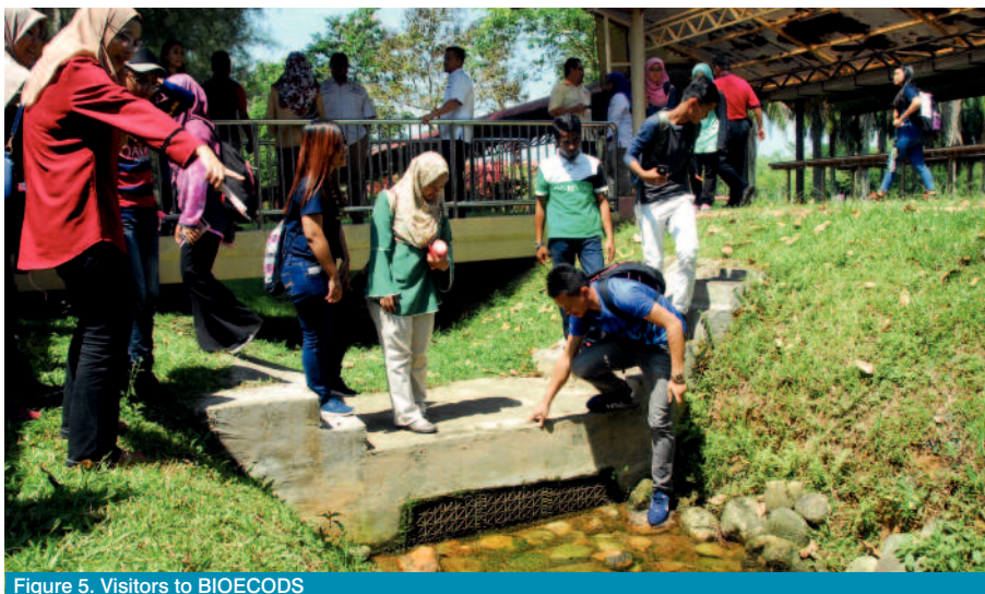
Figure 5. Visitors to BIOECODS