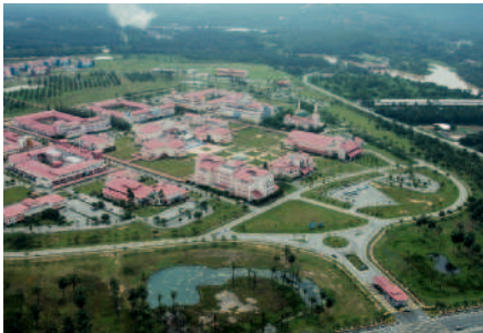
Figure 1. BIOECODS as a National Pilot Project @ Engineering Campus, Universiti Sains