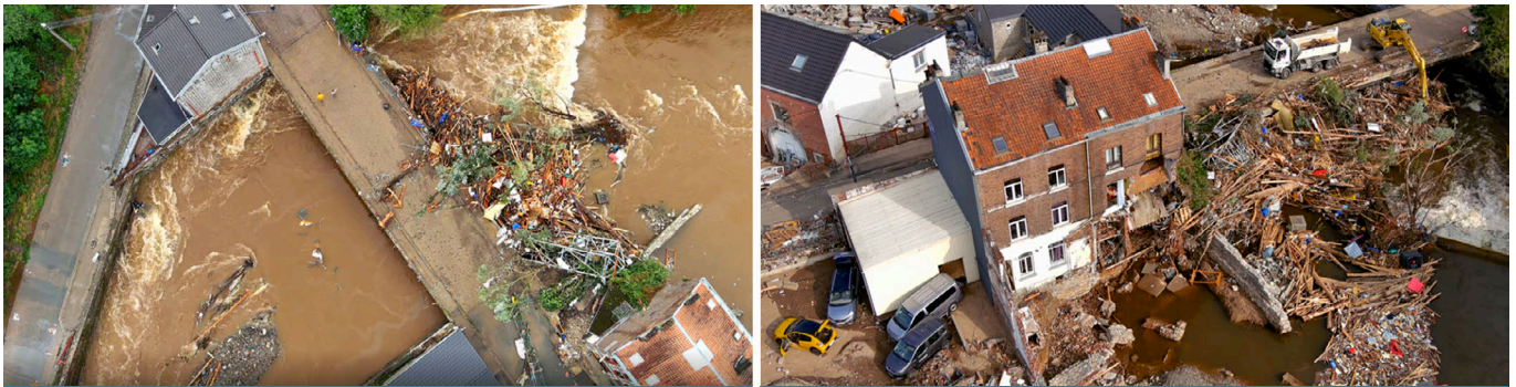
Figure 3 | Role of debris in damming part of the river section, affecting flow depths upstream and leading to flow contraction, scour, and high local damages (river Vesdre, upstream of Verviers).

This highlights the need to integrate flood and drought risk management.