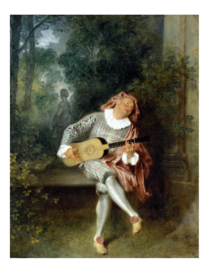
Figure 5 : Le Mezzetin , Jean-Antoine Watteau, 1718-20, oil on canvas, The Metropolitan Museum of Art, New York.