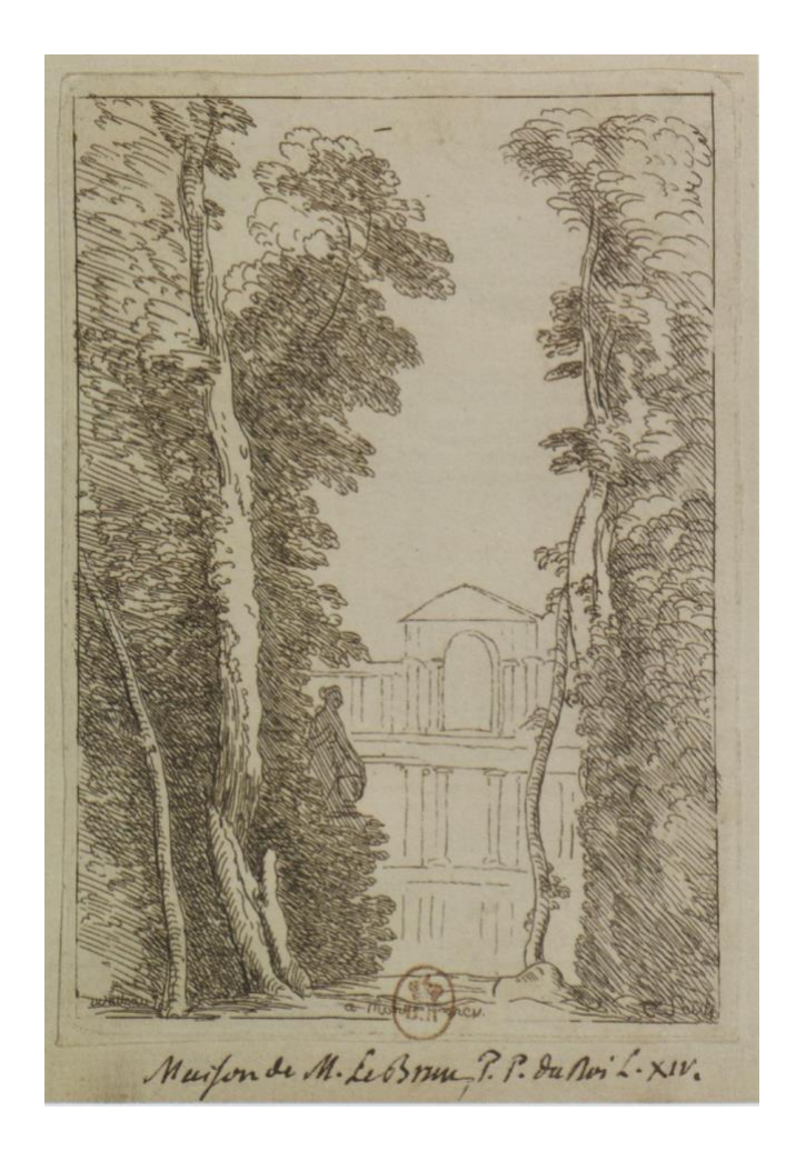
Figure 4 : Engraving of Drawing by Watteau ( Maison de M. Le Brun ), engraving by Comte de Caylus, National Library of France, Paris.