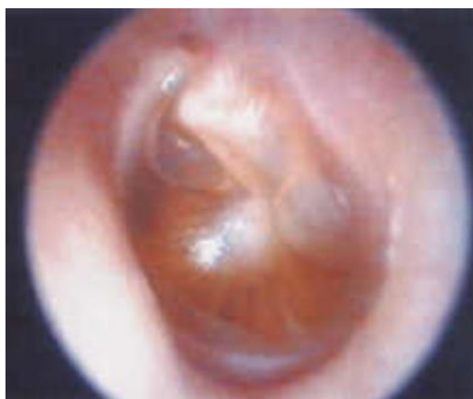
Figure 3. Tympanic membrane with middle-ear effusion but without signs of acute inflammation in a 1-year-old child.

The reference method to detect MEE is tympanocentesis, that allows not only the evaluation of the presence of MEE but also its characteristics, differentiating true AOM from otitis media with effusion (OME). Figure 3 shows the TM of a 1-year-old child with a diagnosis of OME.