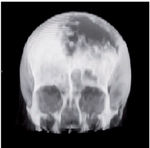
Figure 1. Computed Tomography revealing wide fronto-parietal area of osteolysis