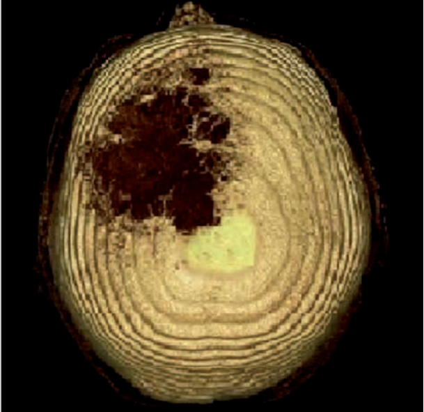
Figure 2. Multiplanar reconstructions of the Computed Tomography to underline the extension of the metastatic lesion